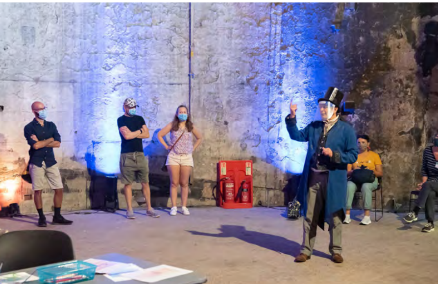
Above: Brunel Museum

We are committed to continuing to work closely with UK governments, and other partners, to support heritage organisations through the months ahead and we're delighted that National Lottery Grants for Heritage from £3,000 to £5million are open again for project funding.