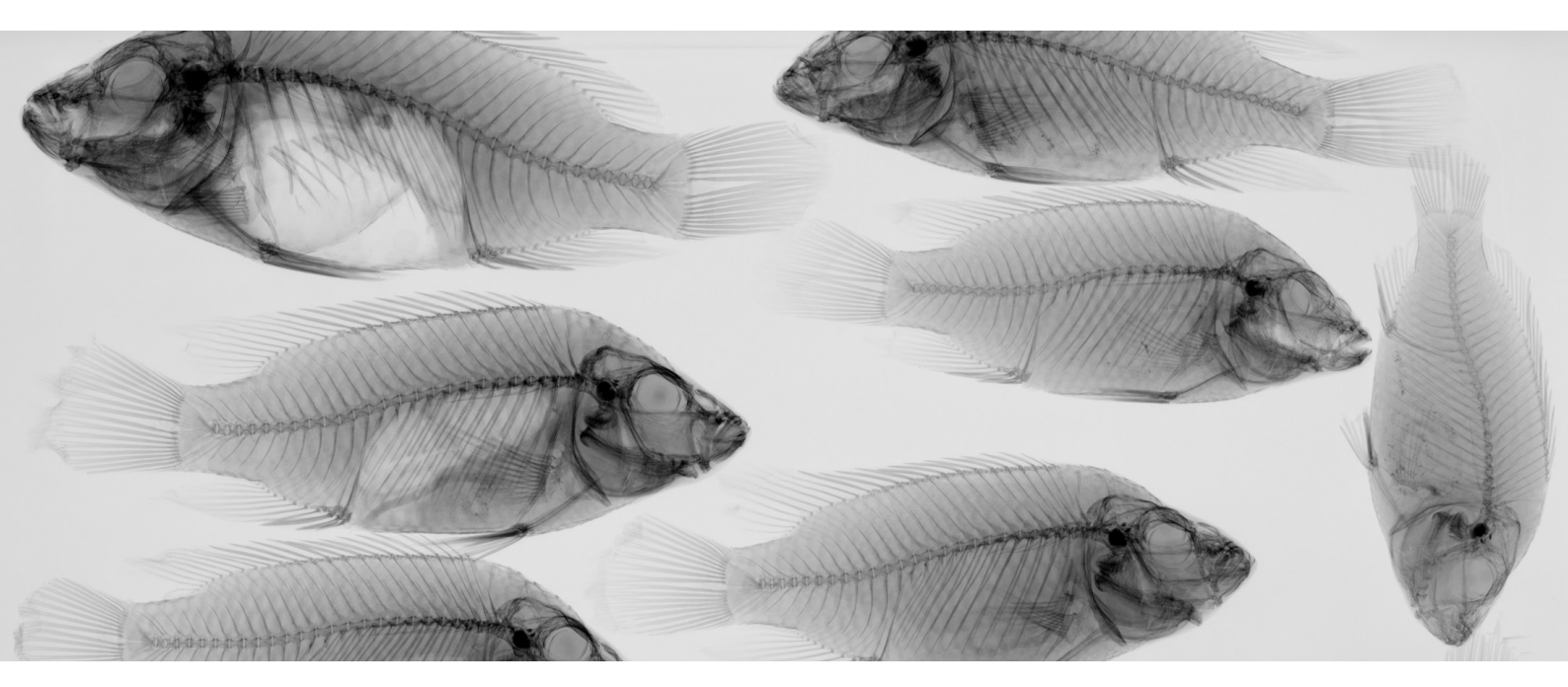
Image: Tilapia guinasana Radiograph (1936)