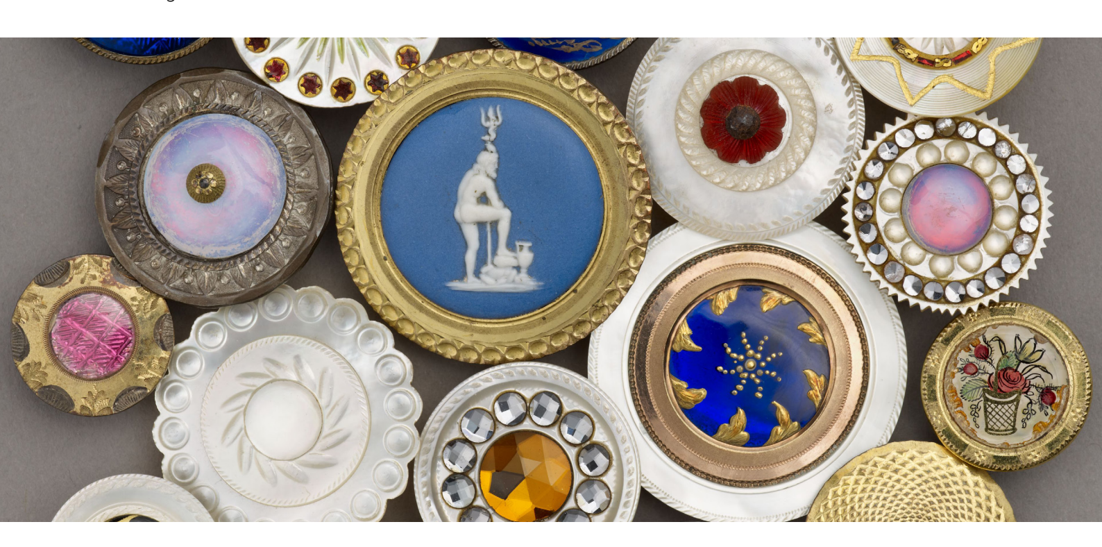
Image: Luckcock button group, Lockcock Collection, Birmingham Museums Trust, CC0 1.0

This can involve building networks for knowledge-exchange and collective planning with institutions across the UK heritage sector as well as creating a space to critically reflect on AI with the public.<sup>16</sup>