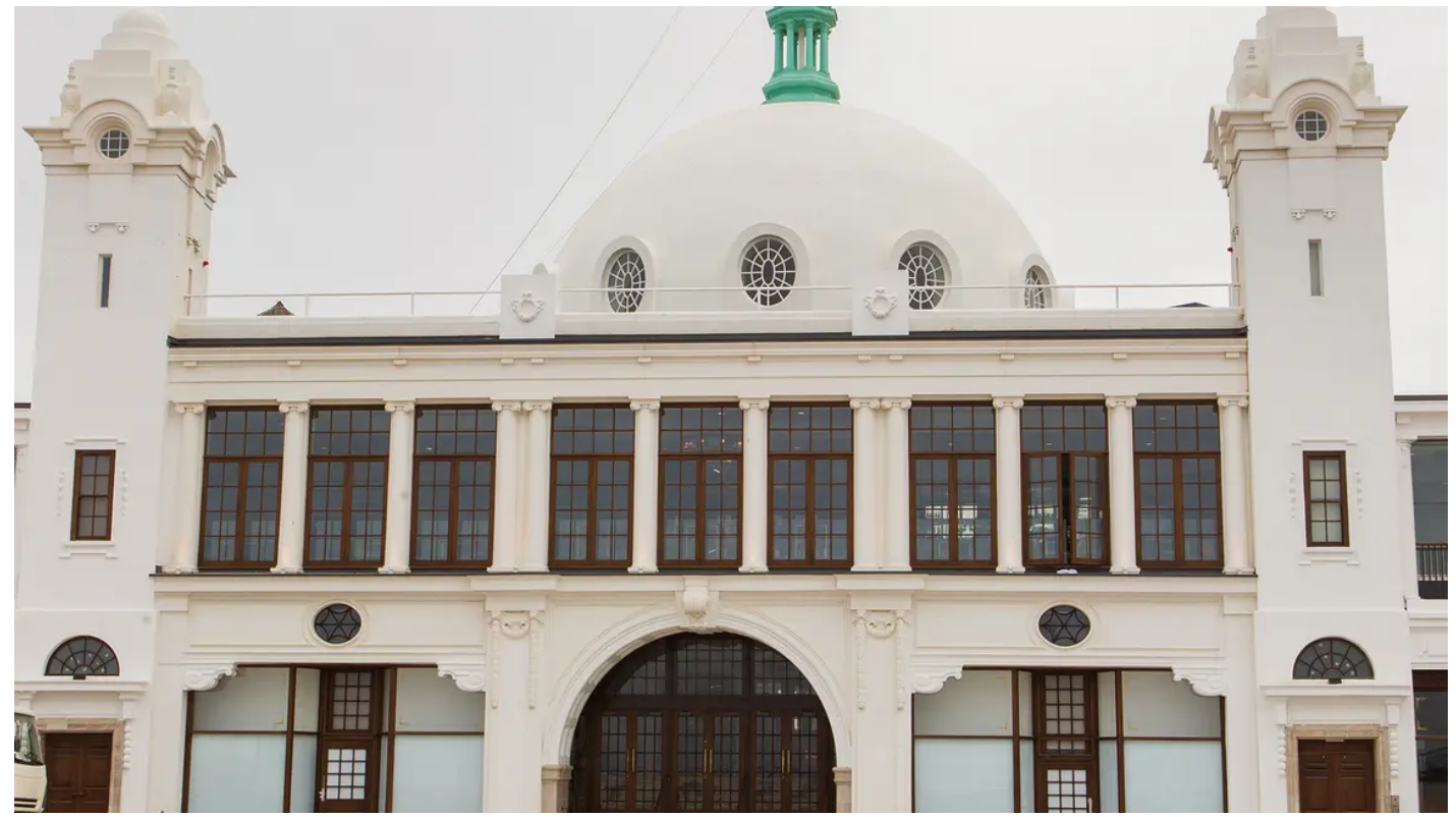
Spanish City Dome following restoration North Tyneside Council The iconic white dome of Whitley Bay's Spanish City will once again welcome visitors following a major National Lottery funded restoration.

People are invited to a weekend of celebrations and sneak peeks on 21 and 22 July before the site opens for business on Monday 23 July.