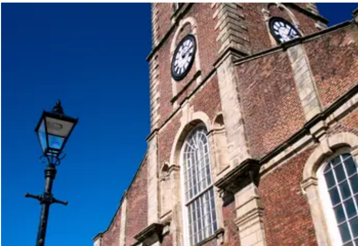
The Canny Space at Holy Trinity, Sunderland