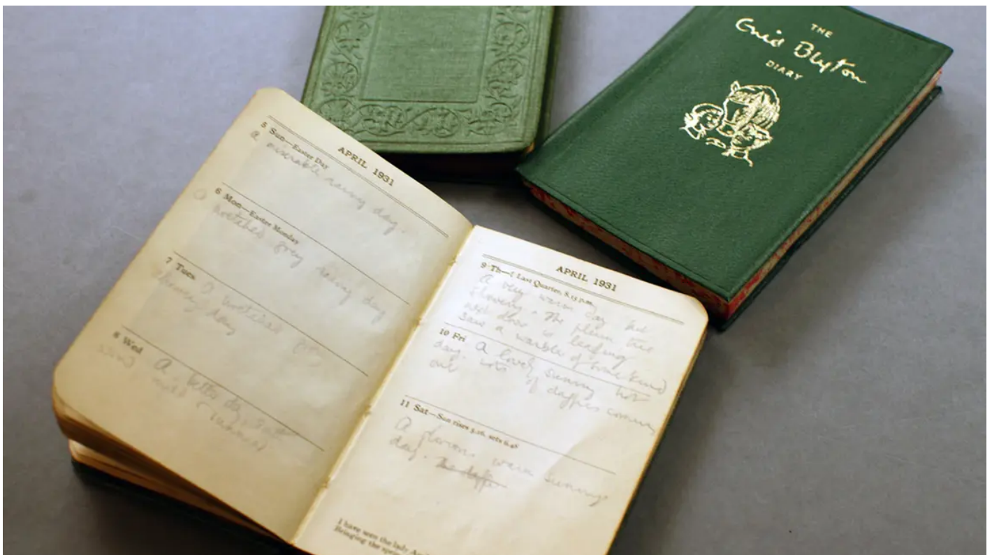
Diaries used by celebrated children's author, Enid Blyton, to record the nature around her Seven Stories, The National Centre for Children's Books