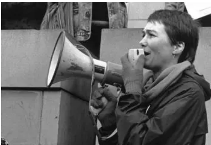
Archival photo of a protester taking part in a Yorkshire rally

"Thanks to National Lottery players this project will help to preserve the role of LGBT+ community in this anniversary year."