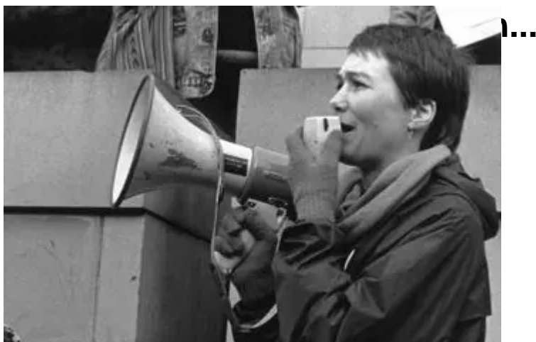
Archival photo of a protester taking part in a Yorkshire rally

"Thanks to National Lottery players this project will help to preserve the role of LGBT+ community in this anniversary year."