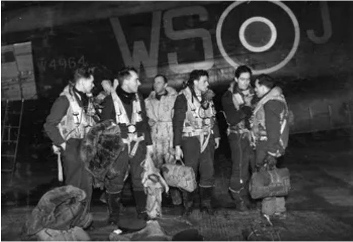
Members of Bomber Command

A number of other National Lottery funded projects are currently underway in 'Bomber Country', including Boston Townscape Heritage , and Lincoln Cathedral Connected .