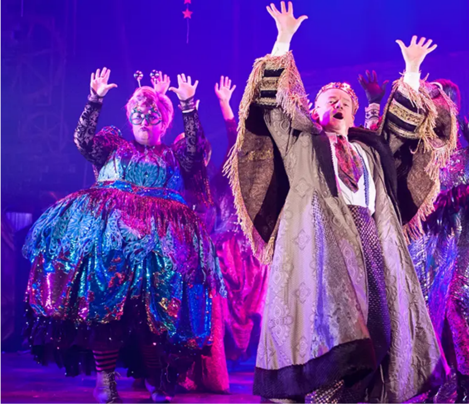
The cast of Cinderella having a ball Tim Morozzo

One of Scotland's oldest and best-loved theatres will undergo its most comprehensive redevelopment in its 137-year history, securing its future and its place as one of the country's outstanding producing theatres.