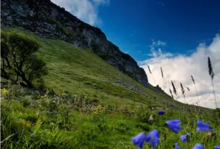
Binevenagh and the Coastal Lowlands