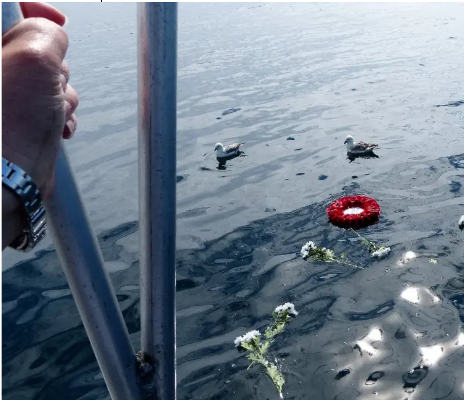
Wreath and flowers laid in memory of those who lost their lives

The memorial plaque placed on the wreck of the Alberta inscribed with the names of the men who died onboard