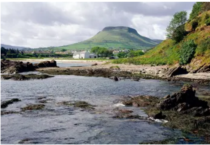
View of the Glens of Antrim

“Now, thanks to National Lottery players these outline plans can be fully developed to deliver a range of benefits for the heritage and the people who live, work and visit there.”