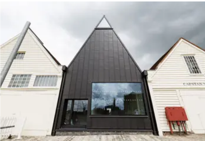
The Command of the Oceans new building