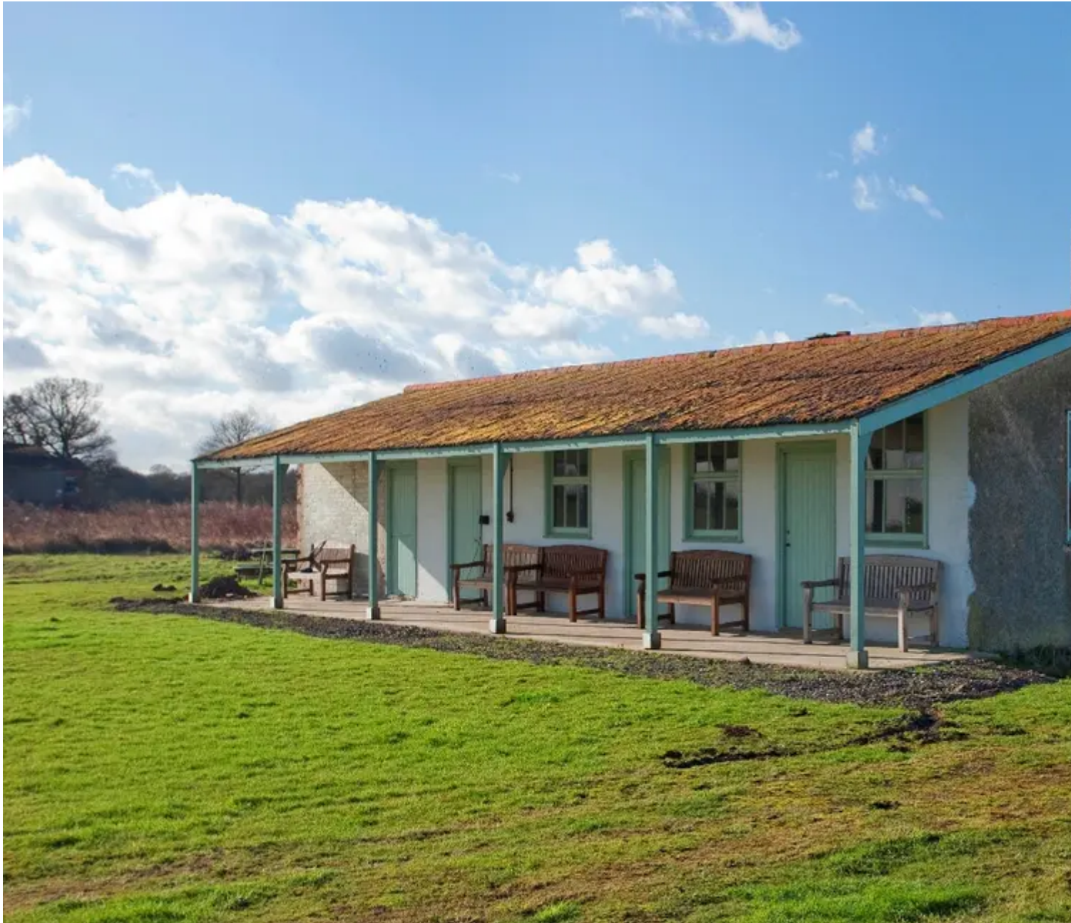
Airside at Stow Maries

Largely forgotten for decades, Stow Maries Great War Aerodrome will be turned into a major visitor attraction.