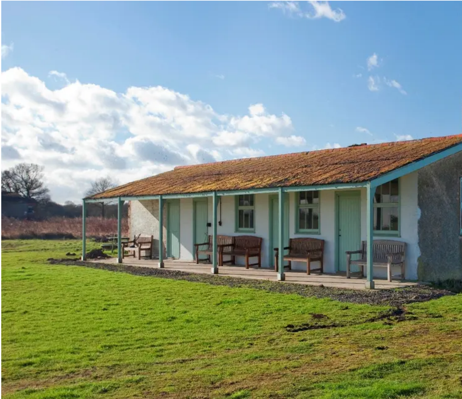
Airside at Stow Maries

Largely forgotten for decades, Stow Maries Great War Aerodrome will be turned into a major visitor attraction.