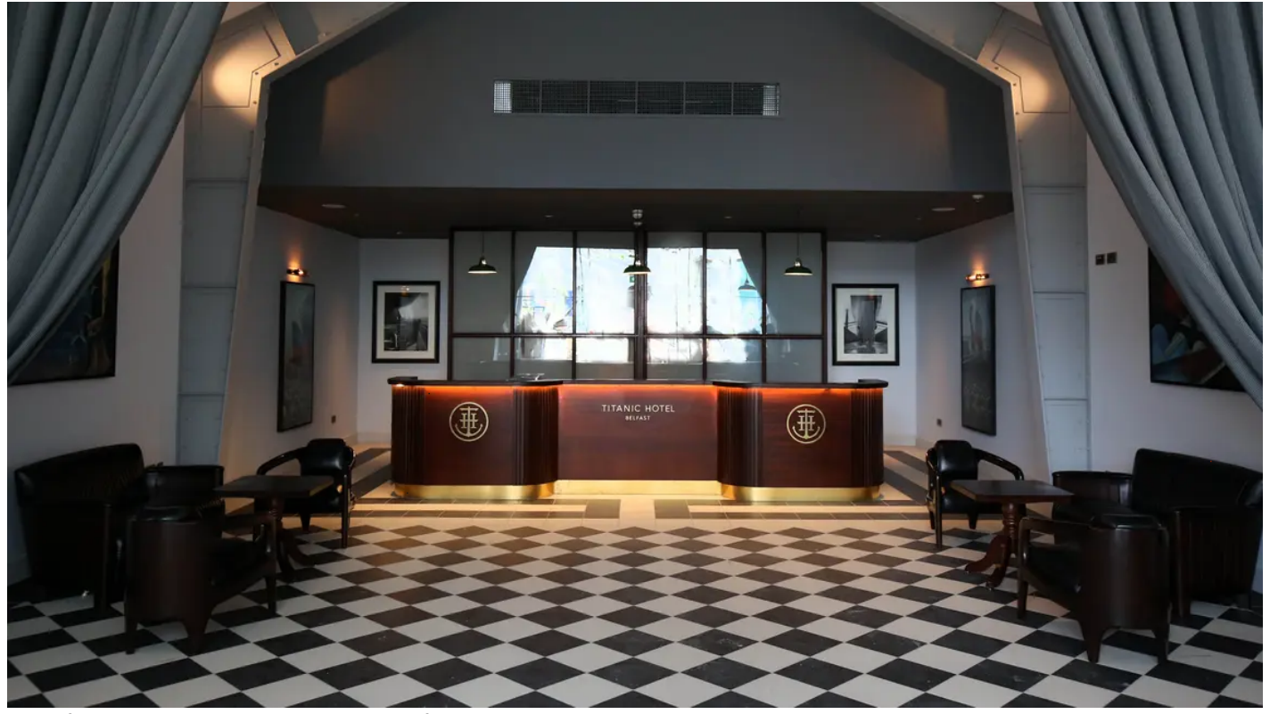
The foyer in the Titanic Hotel Belfast

The official opening of Titanic Hotel Belfast is taking place this weekend.