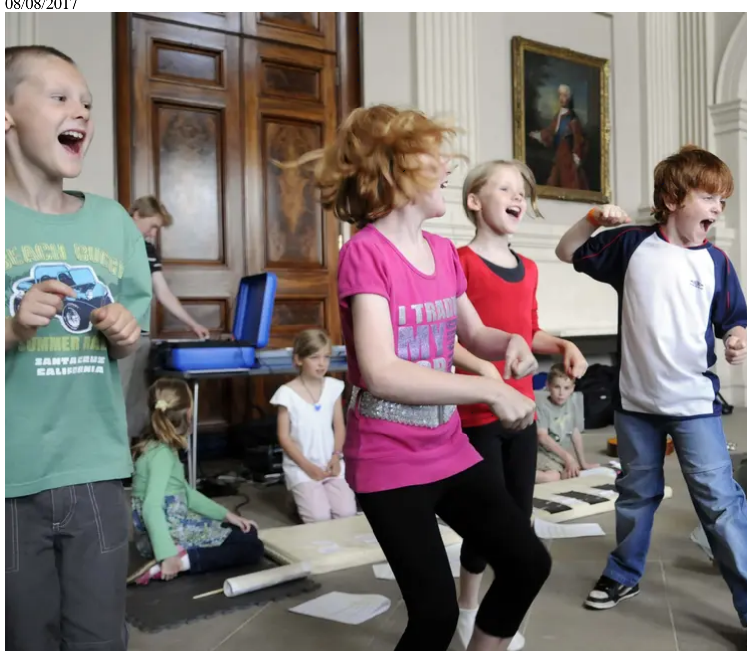
Making Faces at Beningbrough Hall

Are you looking for fun days out this summer? Then take a look at our selection of National Lottery supported days out for all the family.