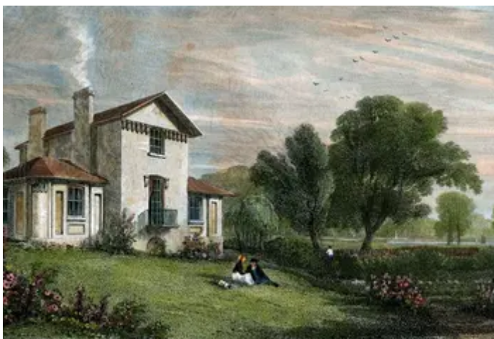
Engraving of Sandycombe Lodge

Returned to its original glory, the house is once more open to the public and full of information and artefacts relating to the life and work of the great painter. Visitors can walk through rooms that Turner lived in, experiencing his world in a uniquely personal way.