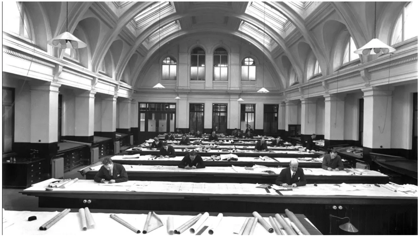
The Drawing Offices in use

The official opening of Belfast's Titanic Hotel is on schedule for just 10 weeks' time.