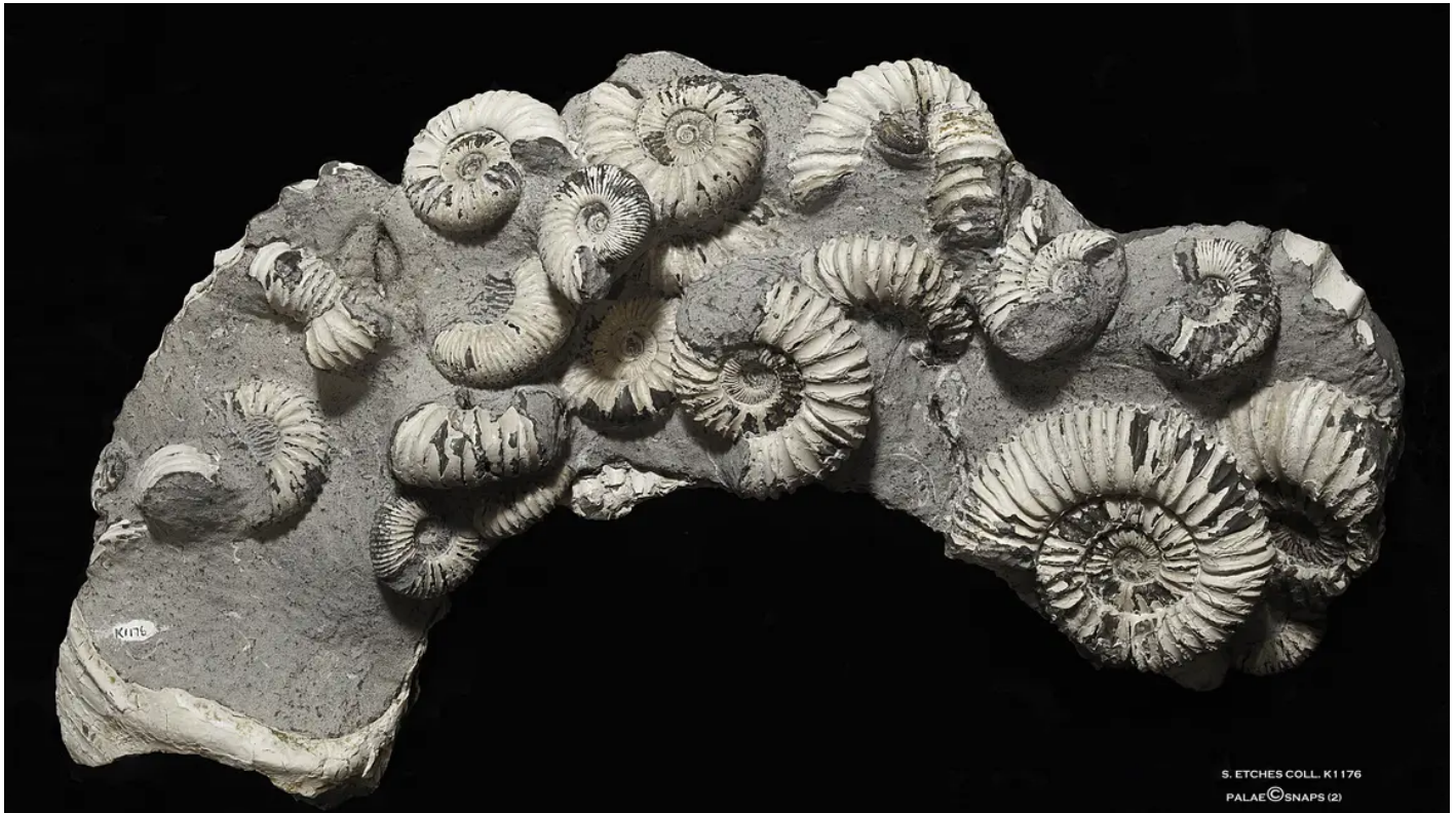
Dibranchiata fossil from The Etches Collection

We love taking trips out to see National Lottery funded places during the holidays and we're hunting for fossils this #FossilFriday.