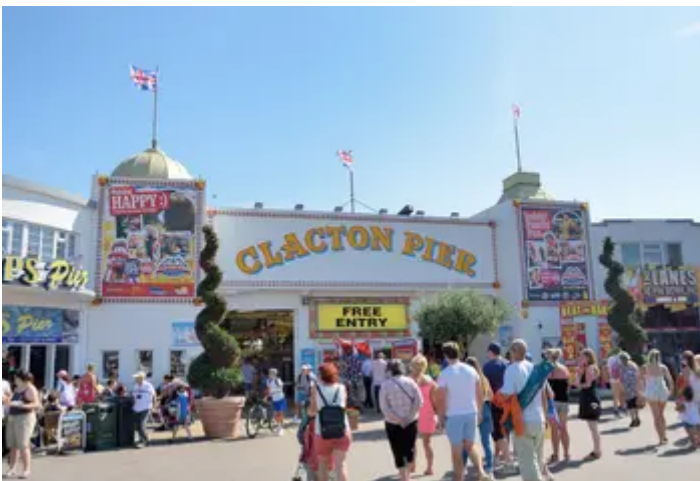
Crowds outside Clacton Pier, Essex - August 2016

Follow our #FossilFriday posts on the HLF Twitter , Instagram and Facebook today. Happy fossil hunting!