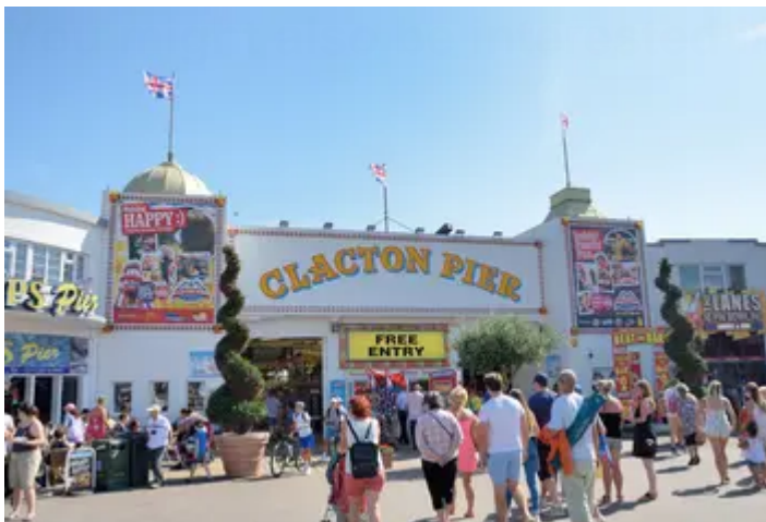
Crowds outside Clacton Pier, Essex - August 2016

Follow our #FossilFriday posts on the HLF Twitter , Instagram and Facebook today. Happy fossil hunting!