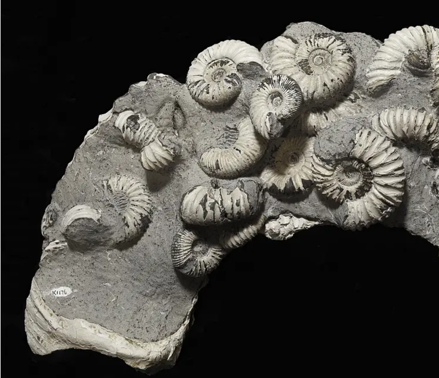
Dibranchiata fossil from The Etches Collection

We love taking trips out to see National Lottery funded places during the holidays and we're hunting for fossils this #FossilFriday.