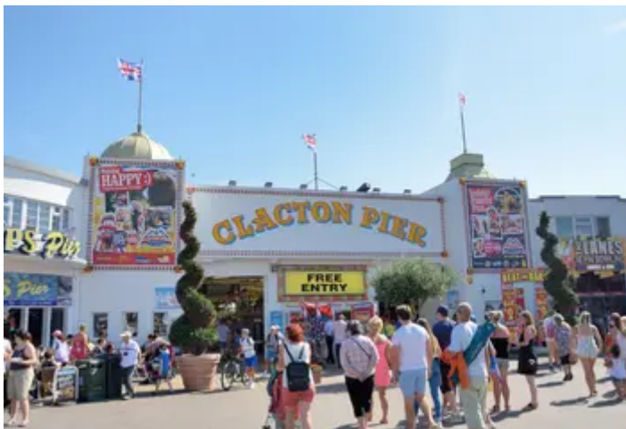
Crowds outside Clacton Pier, Essex - August 2016

Follow our #FossilFriday posts on the HLF Twitter , Instagram and Facebook today. Happy fossil hunting!