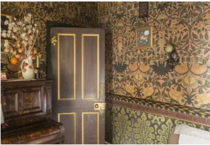
Kitchen wall design in David Parr House David Parr House