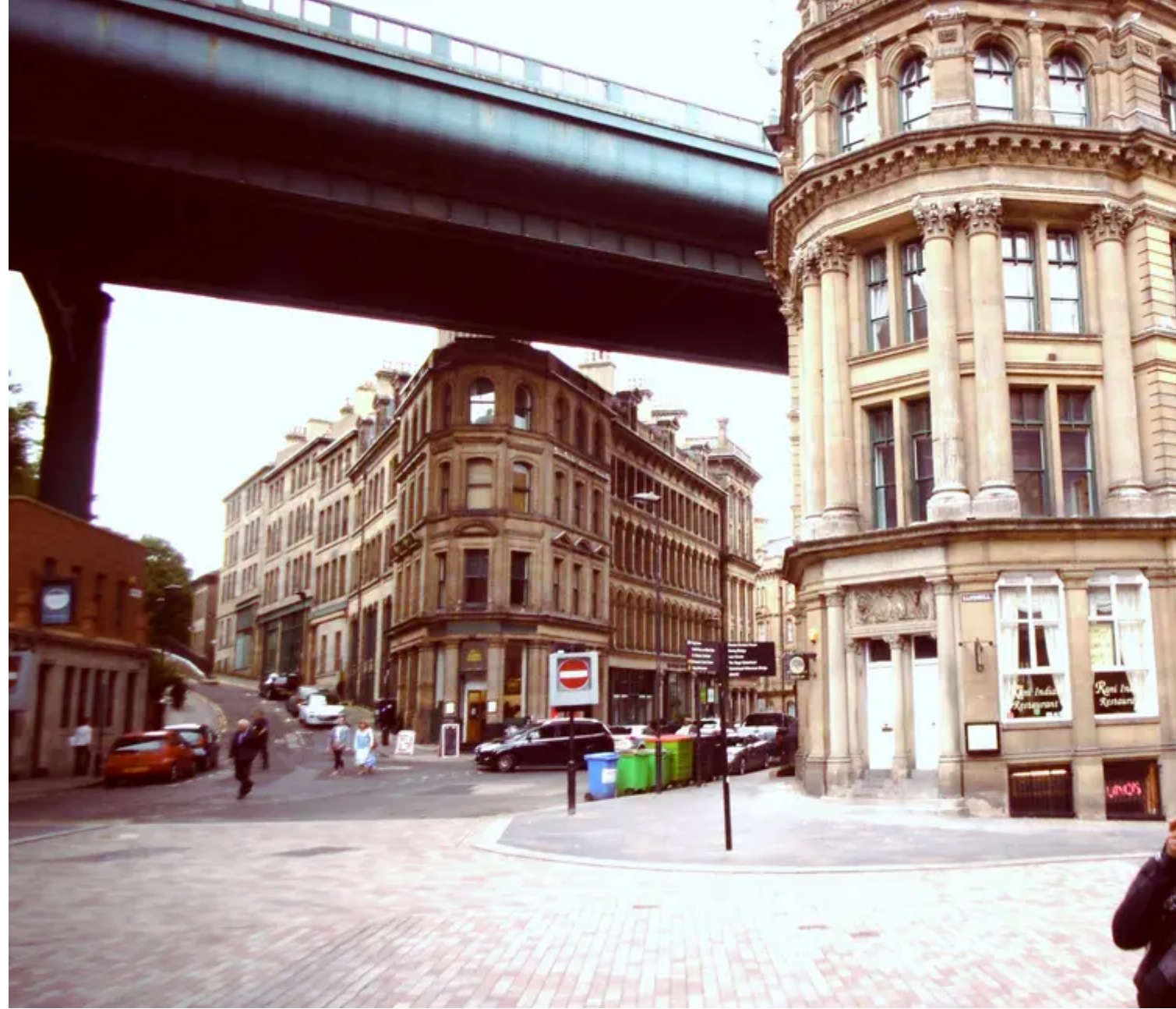
Digital photography was an integral part of the project