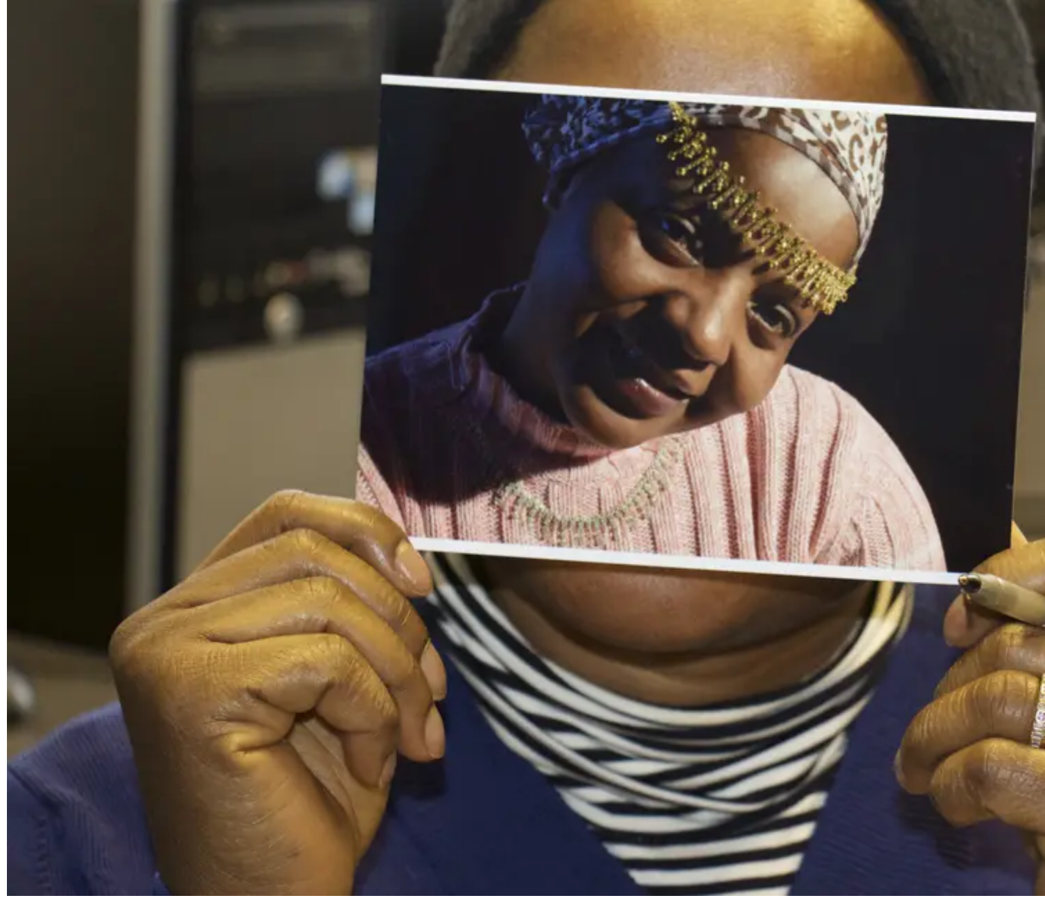
Diverse heritage, shared experiences and hopeful futures – a project made possible by National Lottery players has brought together an incredible group of women.

BAM! Sistahood!, run by the Angelou Centre in Newcastle-upon-Tyne, brought together black, Asian, minority ethnic and refugee women across the North East. The project focused on building skills, using digital tools and building confidence, ensuring the women involved could become the custodians of their own heritage.