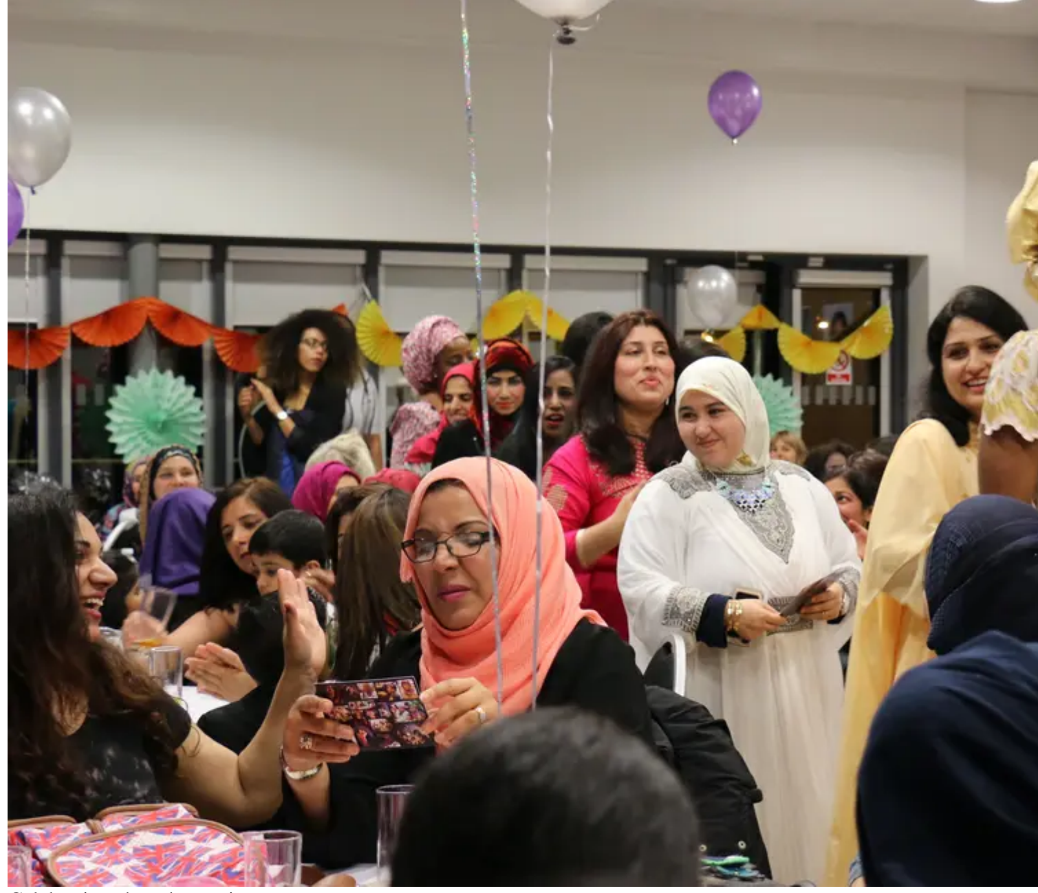
Celebrating shared experiences