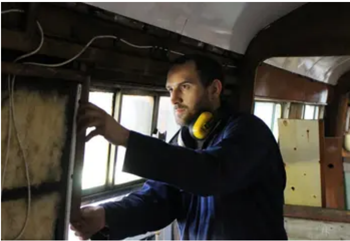
The Daniel Adamson

Changing lives: full steam ahead for heritage railway careers