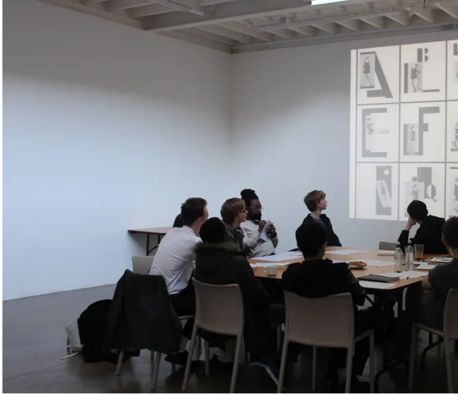
The Art Assassins, the South London Gallery's young people's forum 2018 will mark the 70th anniversary of the formation of the National Health Service. This year, two projects will explore the history of healthcare thanks to nearly £100,000 from National Lottery players.

Thanks to £49,800 from National Lottery players, Eastside Community Heritage (ECH) will work with current and retired NHS staff to explore the history of Harold Wood Hospital in London, and plan their celebrations of the post-war establishment of the NHS.