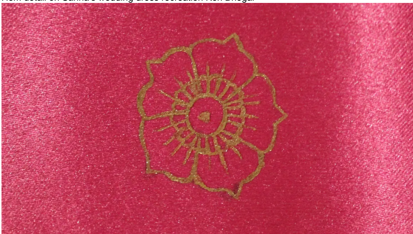
Sanna's wedding dress recreation features hand printed roses - her grandmother's favourite flower Ken Bhogal