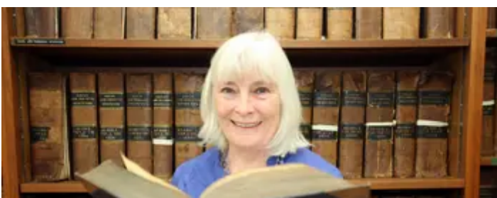
ainee to curator