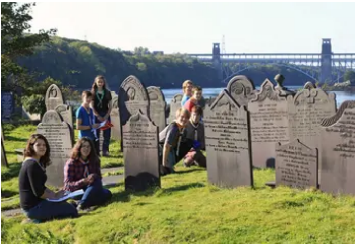
1st Menai Bridge Scout Group finding out about the scout leaders who went to fight in the First World War.