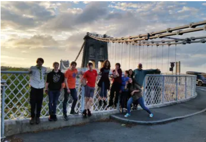
1st Menai Bridge Scout Group finding out about the scout leaders who went to fight in the First World War