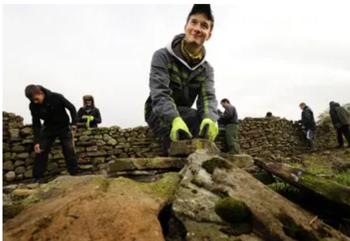
A trainee learns dry stone walling on an HLF project in the North West