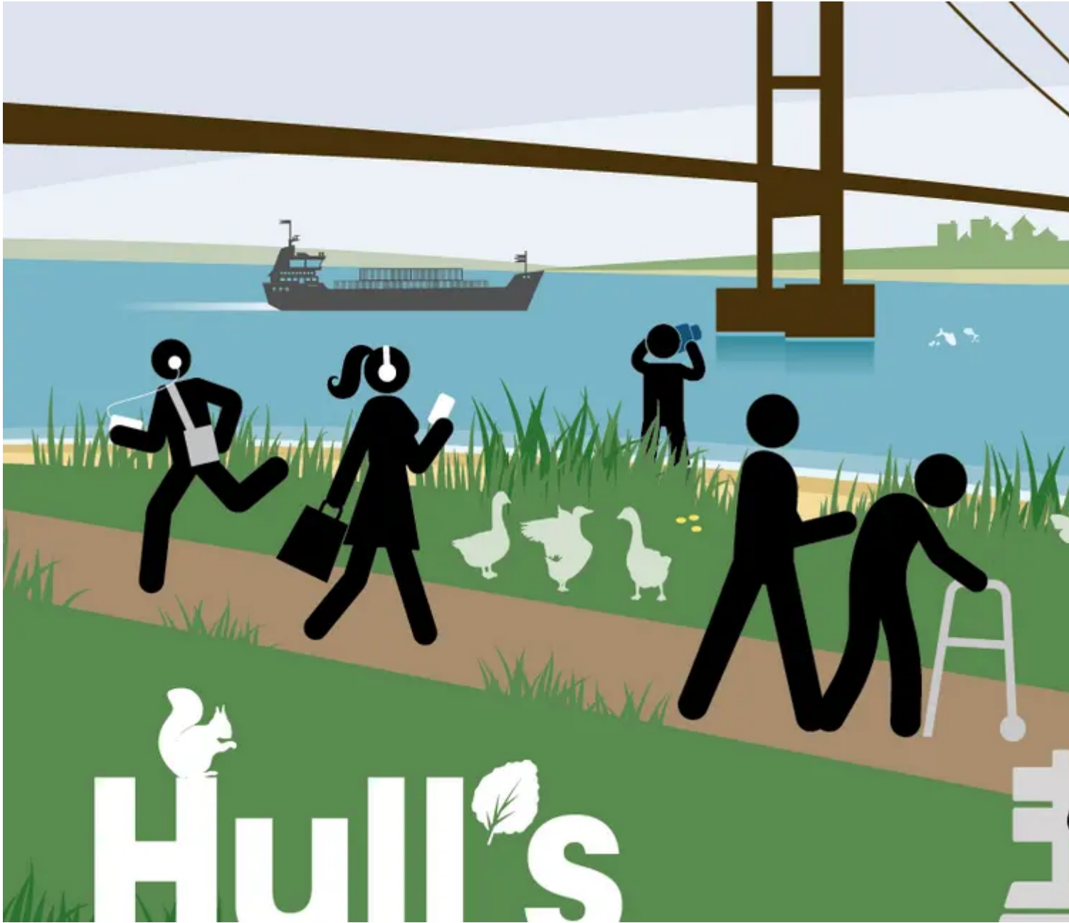
Hull's back garden campaign poster

As summer is in full swing it is time to celebrate our natural heritage and get out into nature. Hull's back garden is part of our wider awareness raising campaign to draw attention to the important wildlife that is all around us.