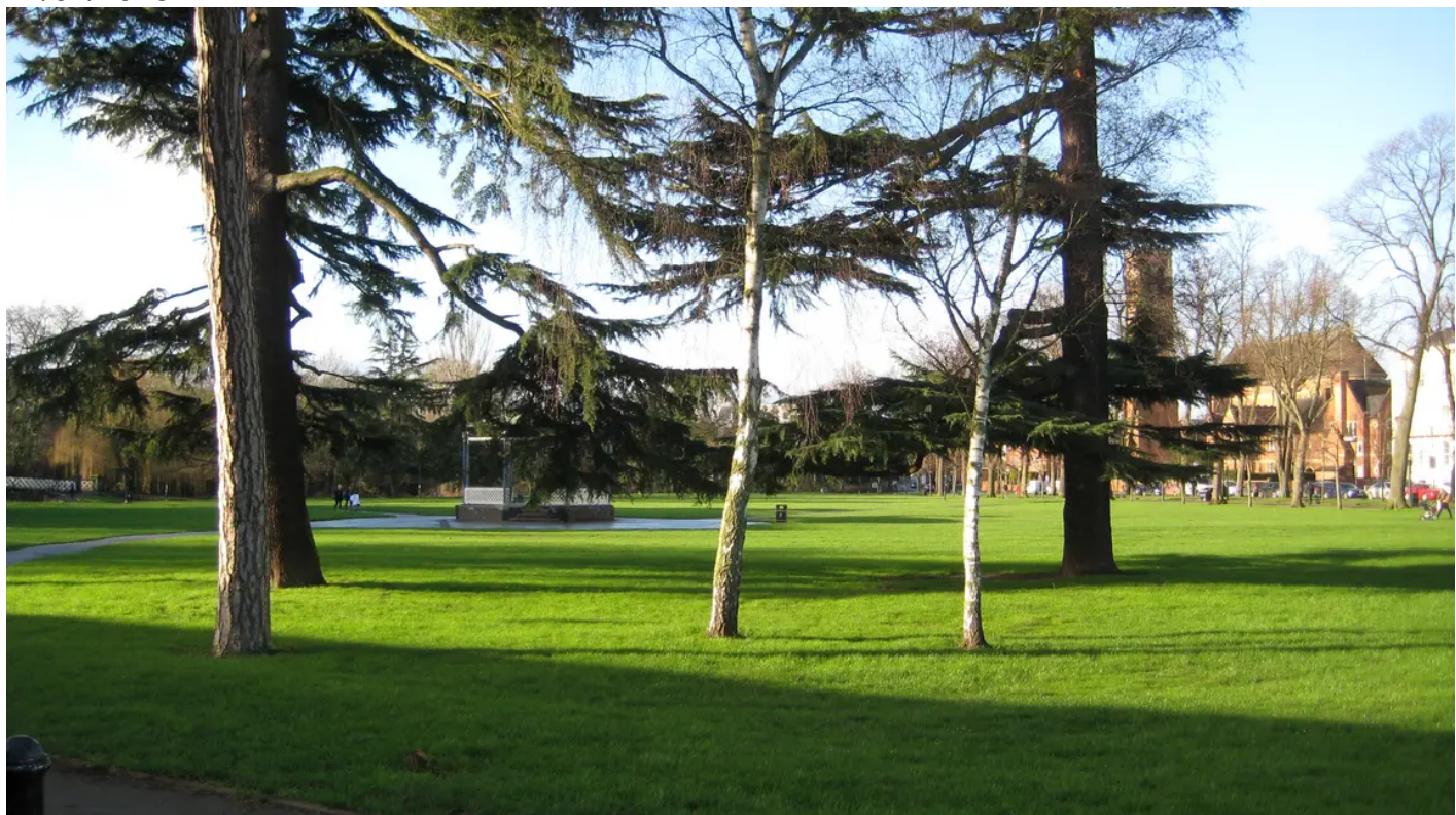
Pump Room Gardens have received National Lottery funding

A comprehensive programme of works is scheduled to begin in September and will include a complete restoration of the iconic bandstand, resurfacing of the paths and a new drainage system. The riverbank will be replanted to encourage wildlife and to open up historic views of the river from the gardens.