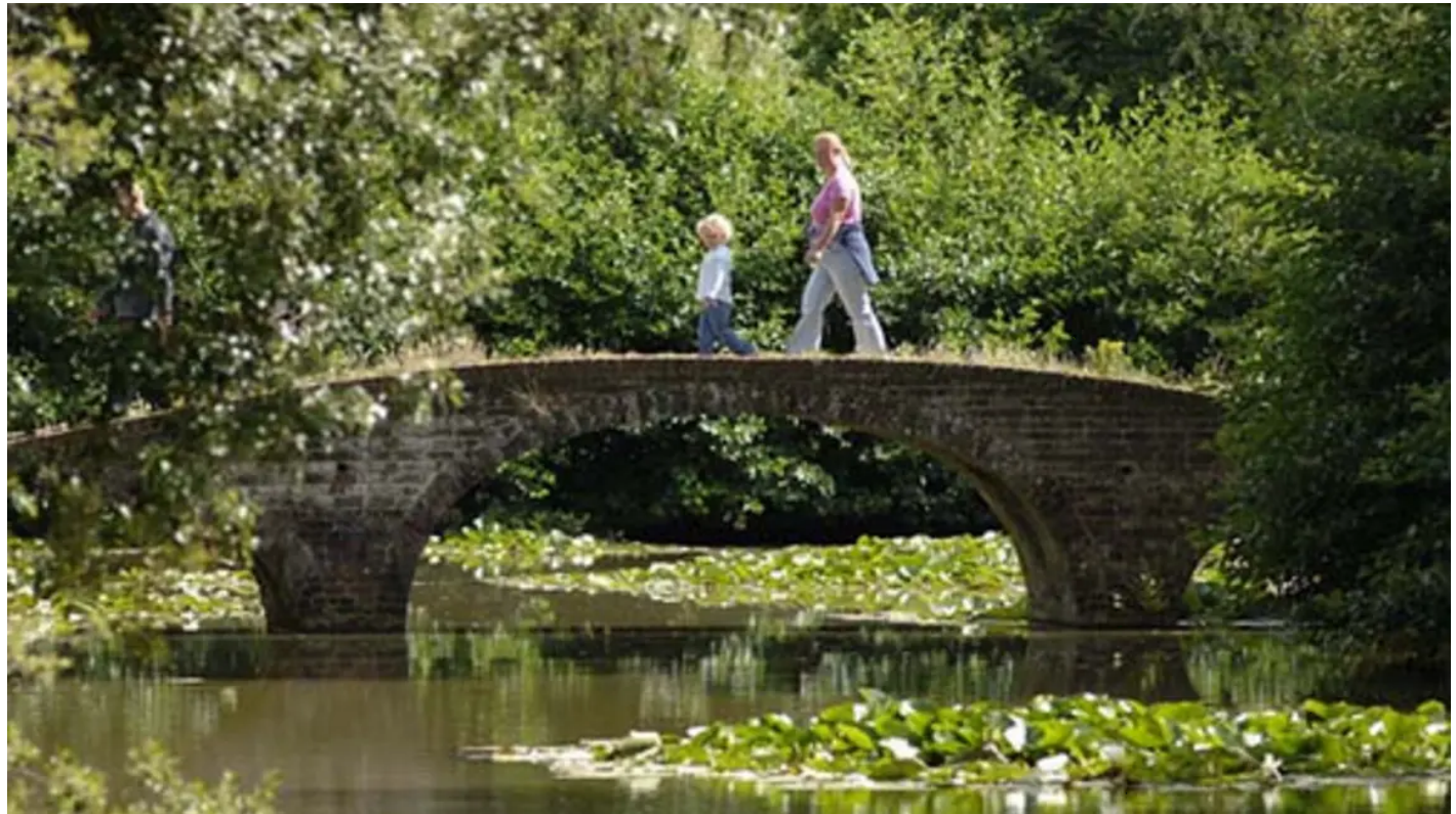
Staunton Country Park plans achieve National Lottery support

Thanks to National Lottery players, a Parks for People grant of £122,700 will be used to develop detailed plans for a £2.85million second round bid*. If successful the project will invest over £4m in restoration of the historic estate, ahead of Staunton's bicentenary in 2019.