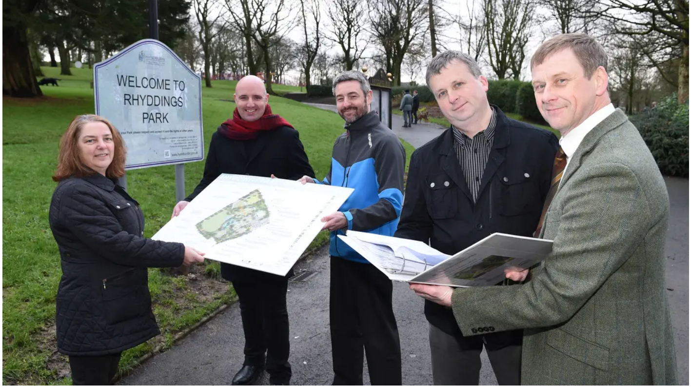
Rhyddings Park will be transformed

It is thanks to a grant from the Heritage Lottery Fund (HLF) and Big Lottery Fund (BIG) secured by Newground Together and Hyndburn Borough Council.