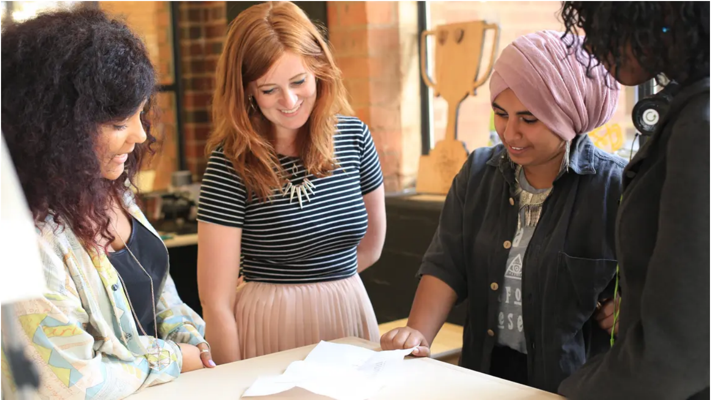
The Style Africa project

The 'Route2Roots' campaign, being run by the Heritage Lottery Fund (HLF) and Youth Engagement Agency Beatfreeks, encourages 11-25 year olds to discover their past and think about the history of things and places that are important to them.