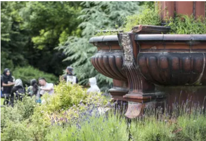
Mawson fountain restoration is approved