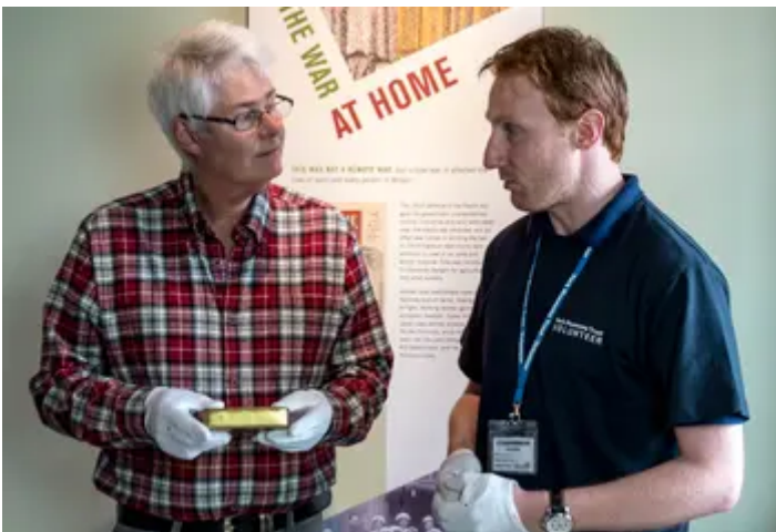
Volunteer at the Hands on Here exhibition at York Castle Museum