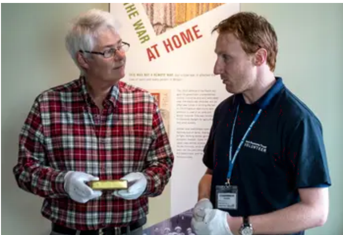
Volunteer at the Hands on Here exhibition at York Castle Museum