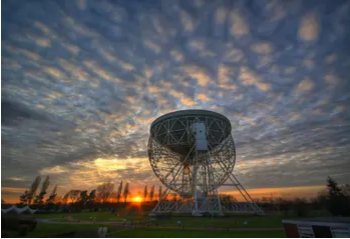
The Lovell Telescope at Jodrell Bank at sunset