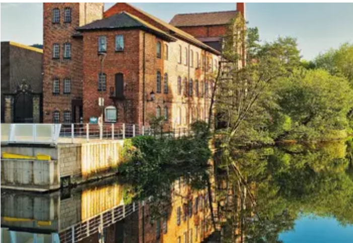
Derby Silk Mill in the Derwent Valley