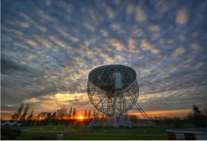
The Lovell Telescope at Jodrell Bank at sunset