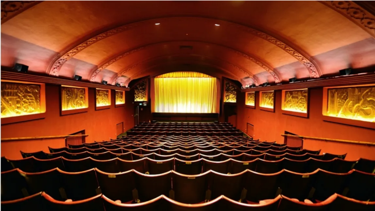
Interior of the refurbished Phoenix Cinema

When the restored 'birthplace of British cinema' in London's Regent Street opens its doors once more in May, it will join a growing number of Heritage Lottery Fund supported projects that are recapturing the golden days of the silver screen in the UK.