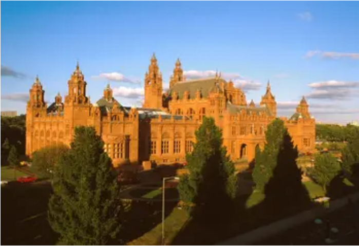
Kelvingrove Art Gallery and Museum

Research reveals Glasgow people think their city's heritage makes it a better place to