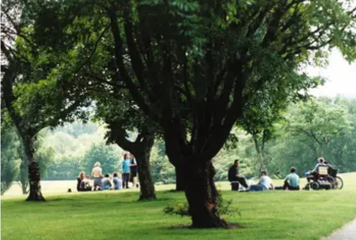
Heaton Park, one of the projects in Manchester featured in the 20 Years 12 Places research

Research reveals Glasgow people think their city's heritage makes it a better place to