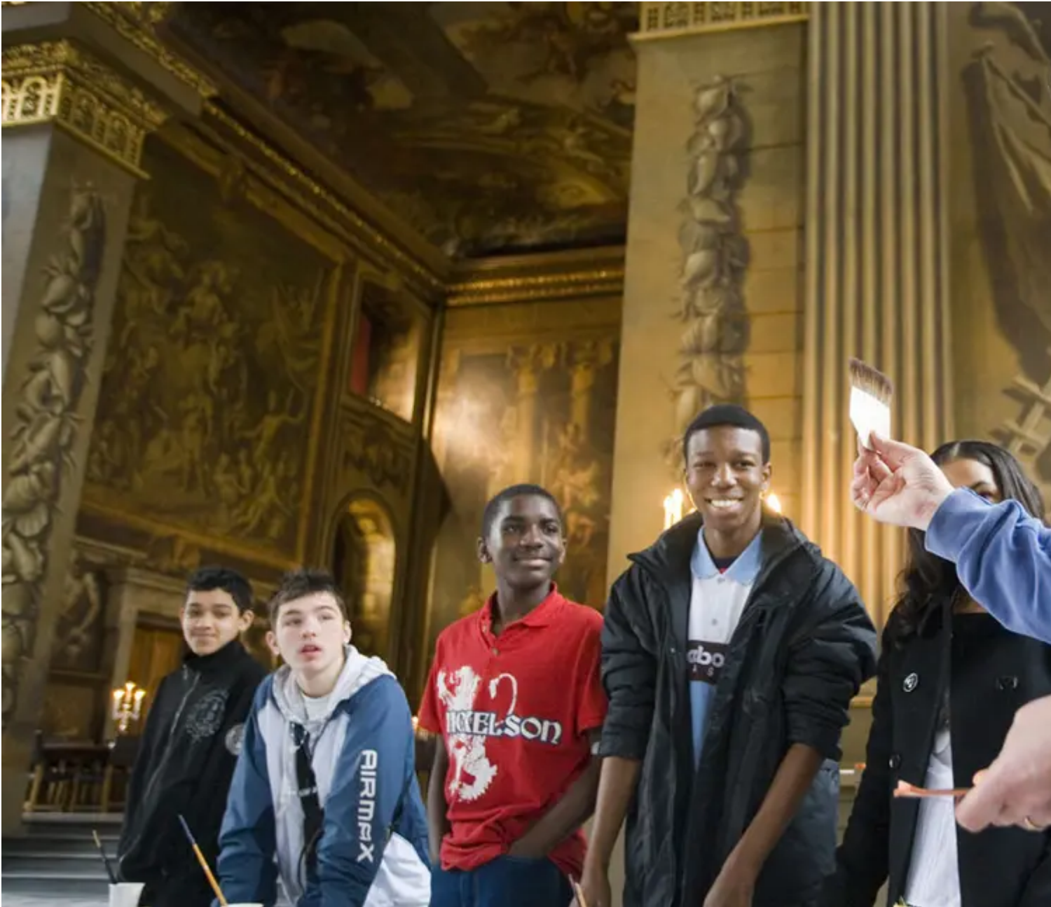
School children exploring the heritage of the Painted Hall in Greenwich

To coincide with 20 years of investment into the UK’s heritage amounting to over £6billion, the Heritage Lottery Fund (HLF) commissioned BritainThinks to conduct in-depth research in 12 towns and cities representative of the UK population. The aim was to better understand the public’s view of that National Lottery investment and to see to what extent it had made places better to live and work in or visit.