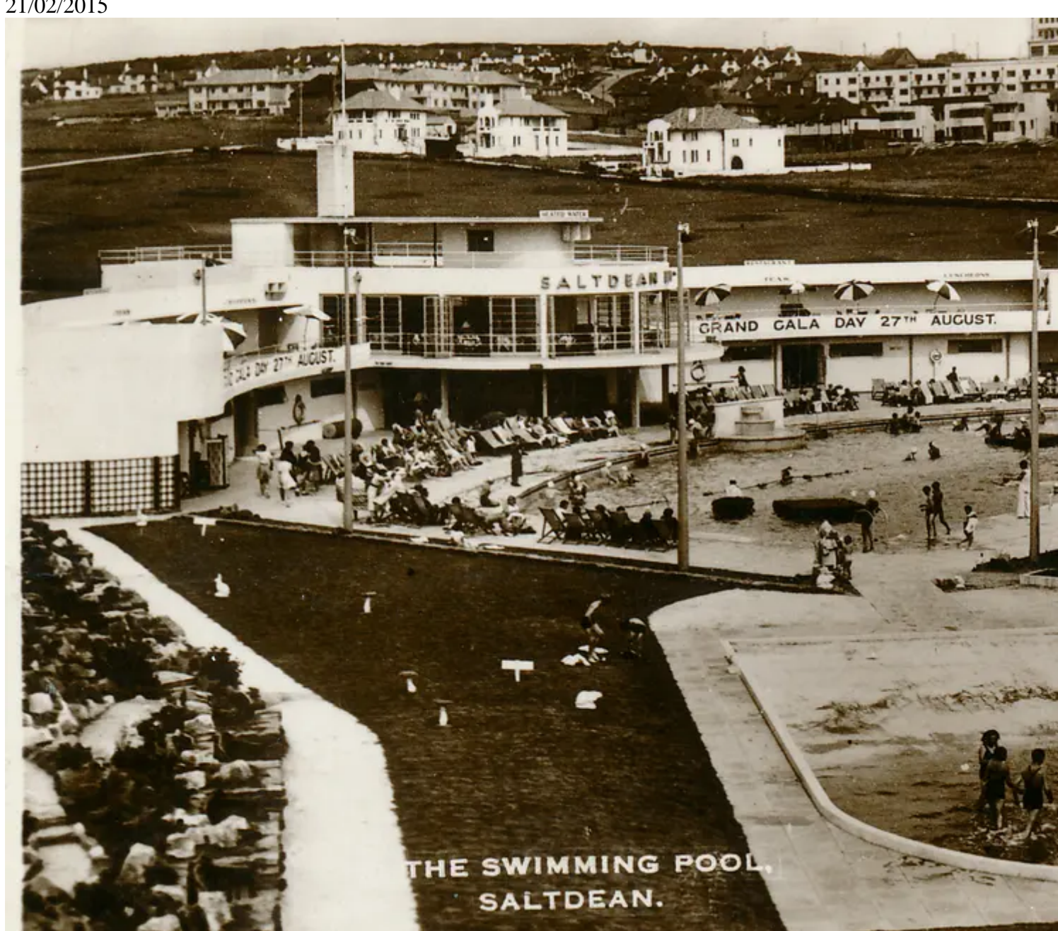
Saltdean Lido in its 1930s heyday

Today, the Heritage Lottery Fund (HLF) has announced initial funding to help restore and reopen to the public Saltdean Lido, England's only Grade II* listed lido.