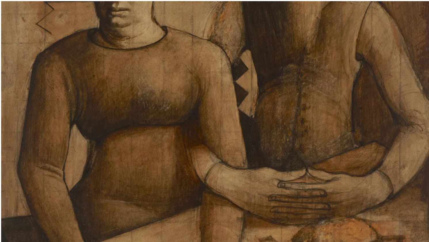
Rabbi and Rabbitzin, 1914, by Mark Gertler (1891-1939)

Art is a powerful medium by which diversity and issues around identity and migration can be expressed.