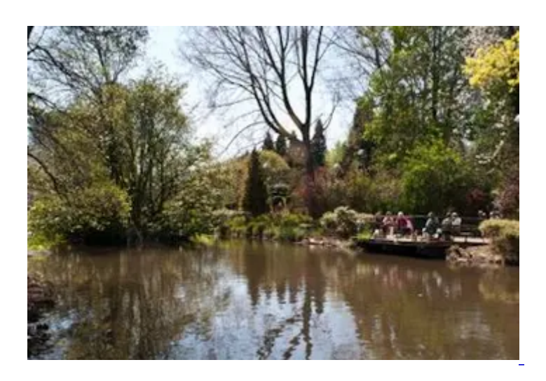
£34.5m Lottery investment in UK's public parks