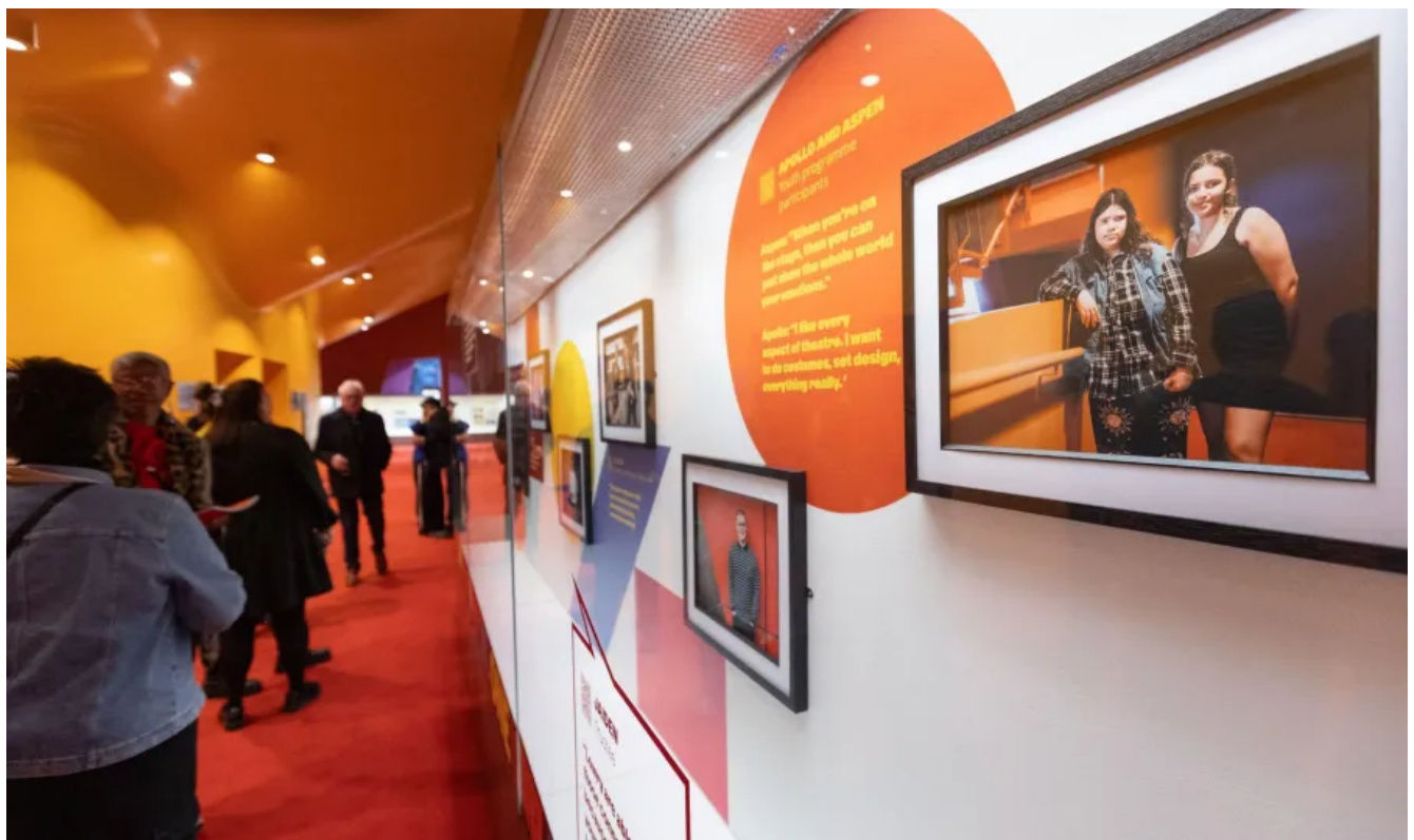
Lowry hosted an exhibition presenting the stories they gathered through oral history interviews.