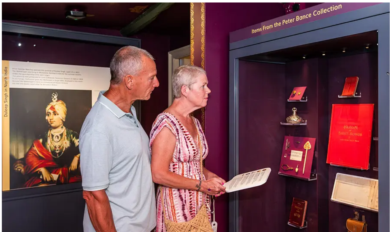
The Duleep Singh family's story spans continents.