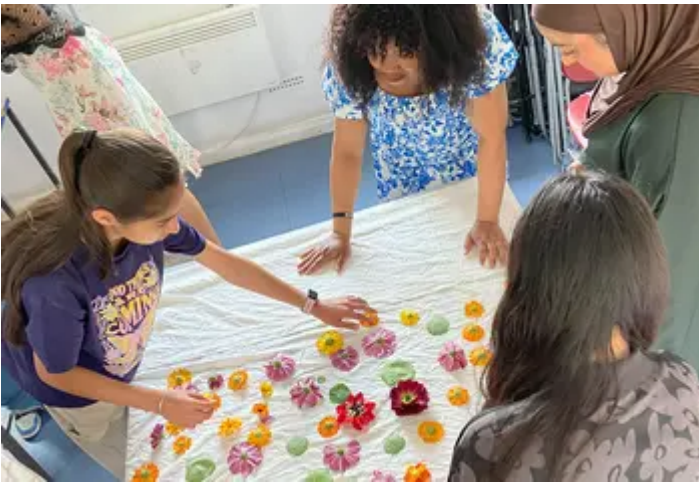
The Botanical Young Women of Hounslow project runs arts workshops to engage young people in heritage.