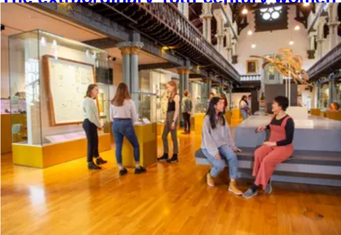
Visitors in the main gallery of The Hunterian Museum.