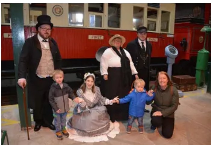
Tour guides at the Foyle Valley Railway and Transport Museum posing with visitors.