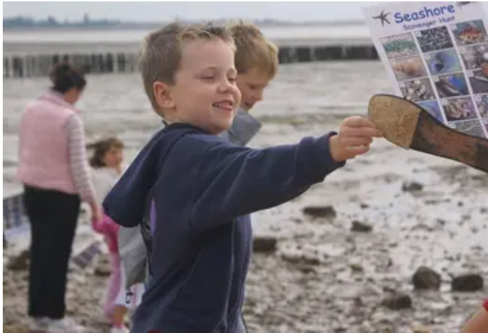
A seashore scavenger hunt at Tendring, one of our Areas of Focus

We regularly conduct research to discover what is happening in the heritage sector, and we evaluate our work to better understand the change we are making. Read more of our insight .