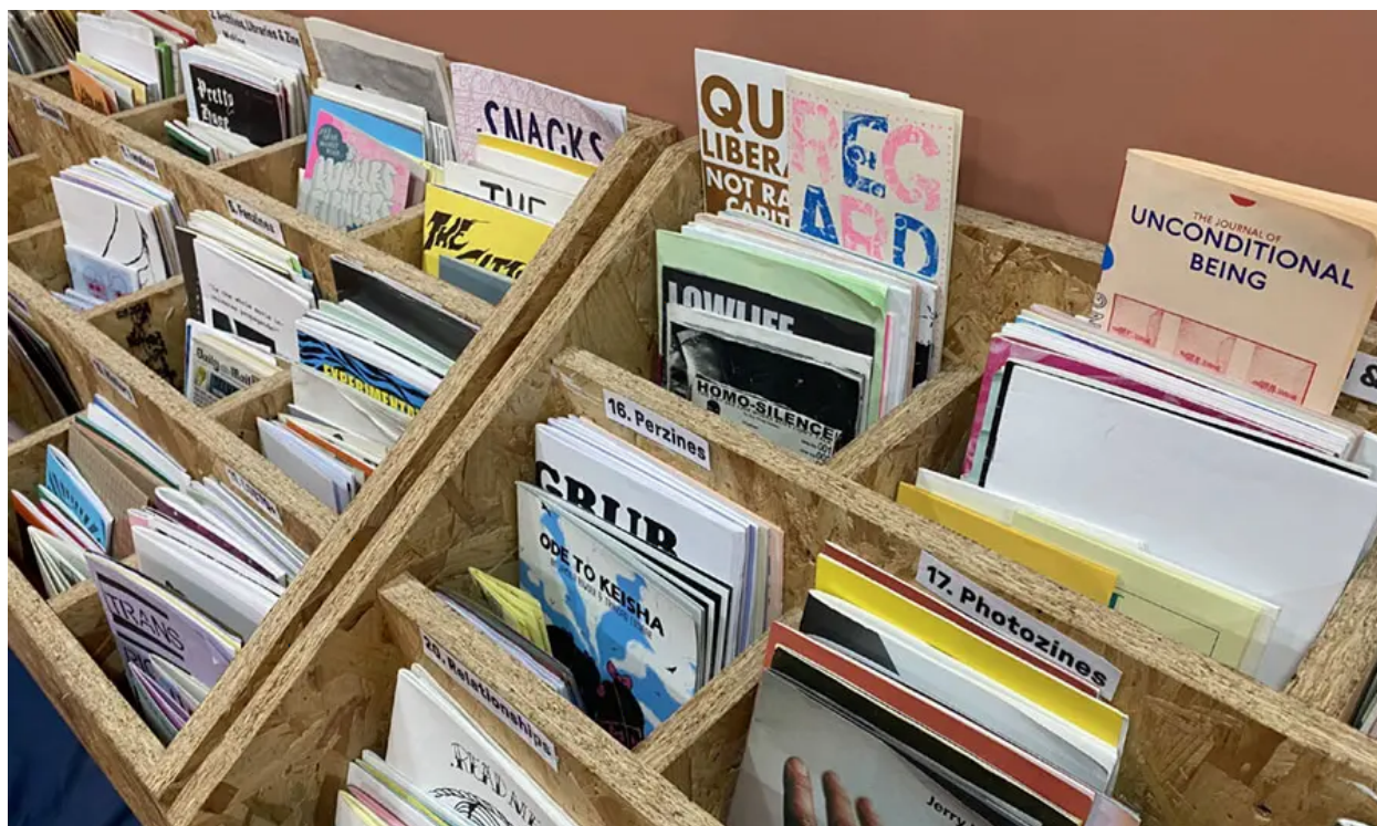
Part of Glasgow Zine Library's collection of zines

It's a self-made publication created and distributed cheaply, usually in small quantities. It can be hand-written, typed, drawn, cut-and-pasted or almost anything else you can imagine.