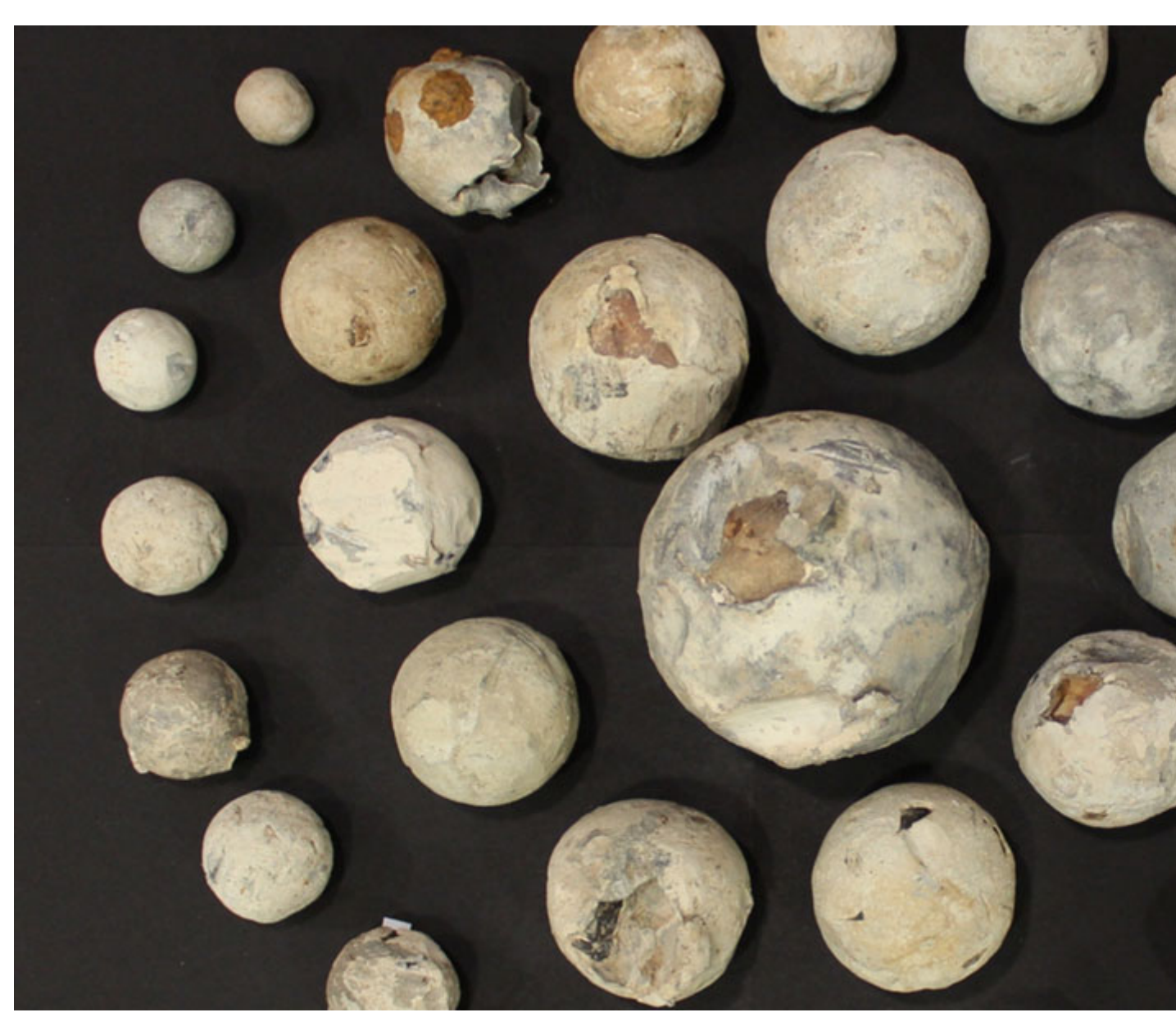
Cannonballs found at the battle site

Our funding supported an investigation to locate and characterise the 1485 Bosworth battlefield where King Richard III was killed and update the Battlefield Heritage Centre's exhibition. The project brought together a