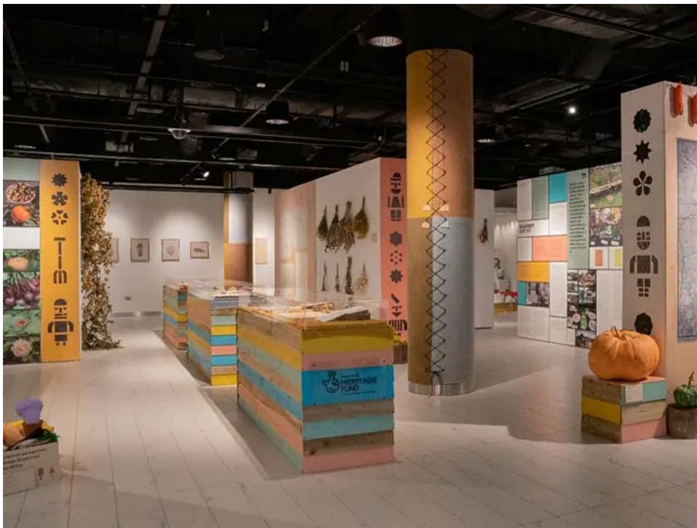
The Wotta Lotta Culture exhibition at the Library of Birmingham.

While documenting and celebrating the history of the UK's first safe space for the LGBTQ+ South Asian community , The Club Kali Network is reducing negative environmental impact every step of the way. Eco-friendly web hosting, virtual meetings and use of recyclable materials and public transport will help reduce the project's carbon footprint.