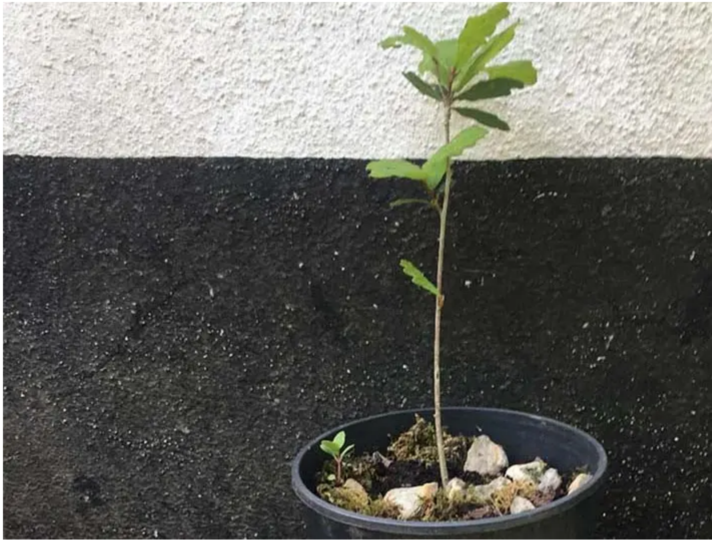
An oak sapling saved from under Britannia's hull.

Alongside restoring Britannia , a 100-year old whelking ship, the Britannia 1915 – Relaunch project is planting a new woodland to revive natural habitats and provide sustainable timber for future boatbuilders.