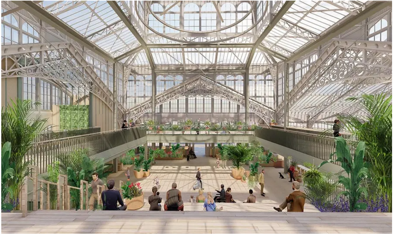
An artist's impression of the redevelopment plans for the Winter Gardens.

Glasgow's Burrell Collection , which reopened in 2022 following a six-year refurbishment, is reducing its carbon footprint and keeping its collections safe at the same time with energy efficient heating and lighting in the form of solar panels and specialist insulating glass.