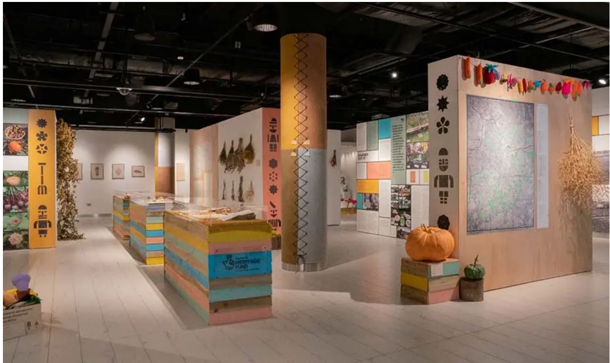
The Wotta Lotta Culture exhibition at the Library of Birmingham.

While documenting and celebrating the history of the UK's first safe space for the LGBTQ+ South Asian community , The Club Kali Network is reducing negative environmental impact every step of the way. Eco-friendly web hosting, virtual meetings and use of recyclable materials and public transport will help reduce the project's carbon footprint.