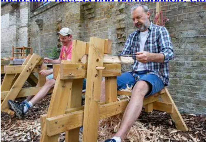
Supporting diversity, equity and inclusion in the great outdoors. Photo: Wayfinding project.