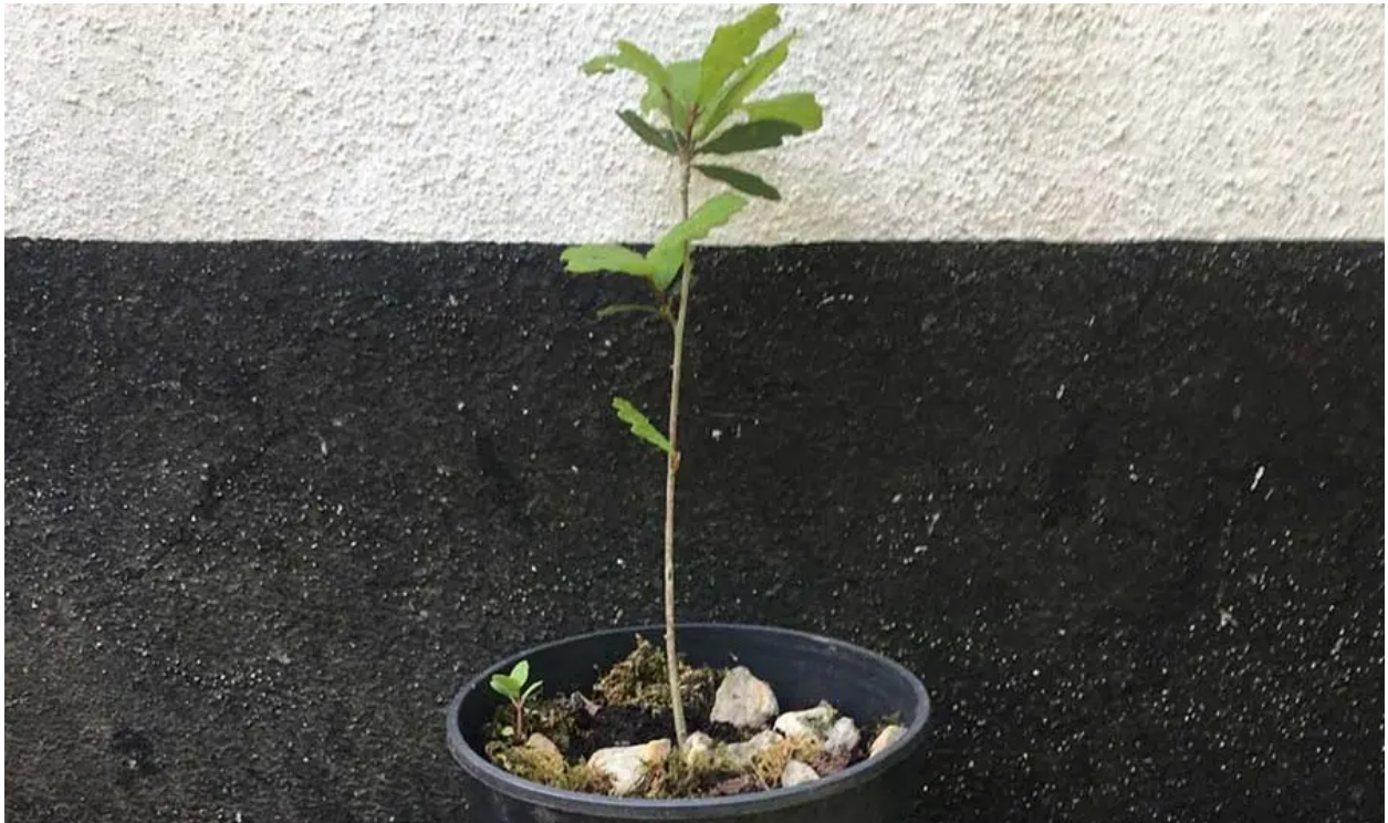
An oak sapling saved from under Britannia's hull.

Alongside restoring Britannia , a 100-year old whelking ship, the Britannia 1915 – Relaunch project is planting a new woodland to revive natural habitats and provide sustainable timber for future boatbuilders.