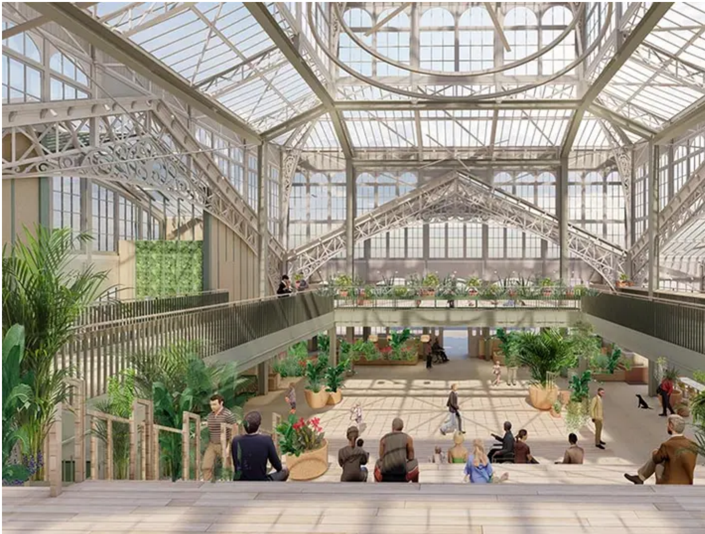
An artist's impression of the redevelopment plans for the Winter Gardens. Credit: Great Yarmouth Borough Council.

This project is giving Great Yarmouth Winter Gardens , the UK's last surviving Victorian ironwork seaside winter garden a new lease of life with passive ventilation, rainwater harvesting and low carbon air source heat pumps.