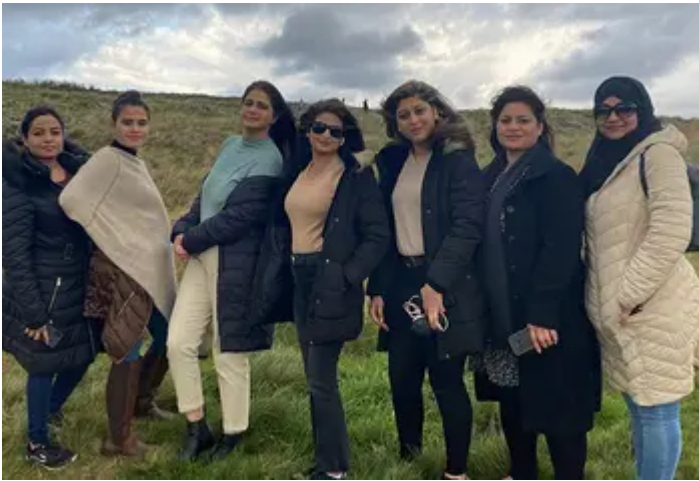
as for a more resilient heritage sector