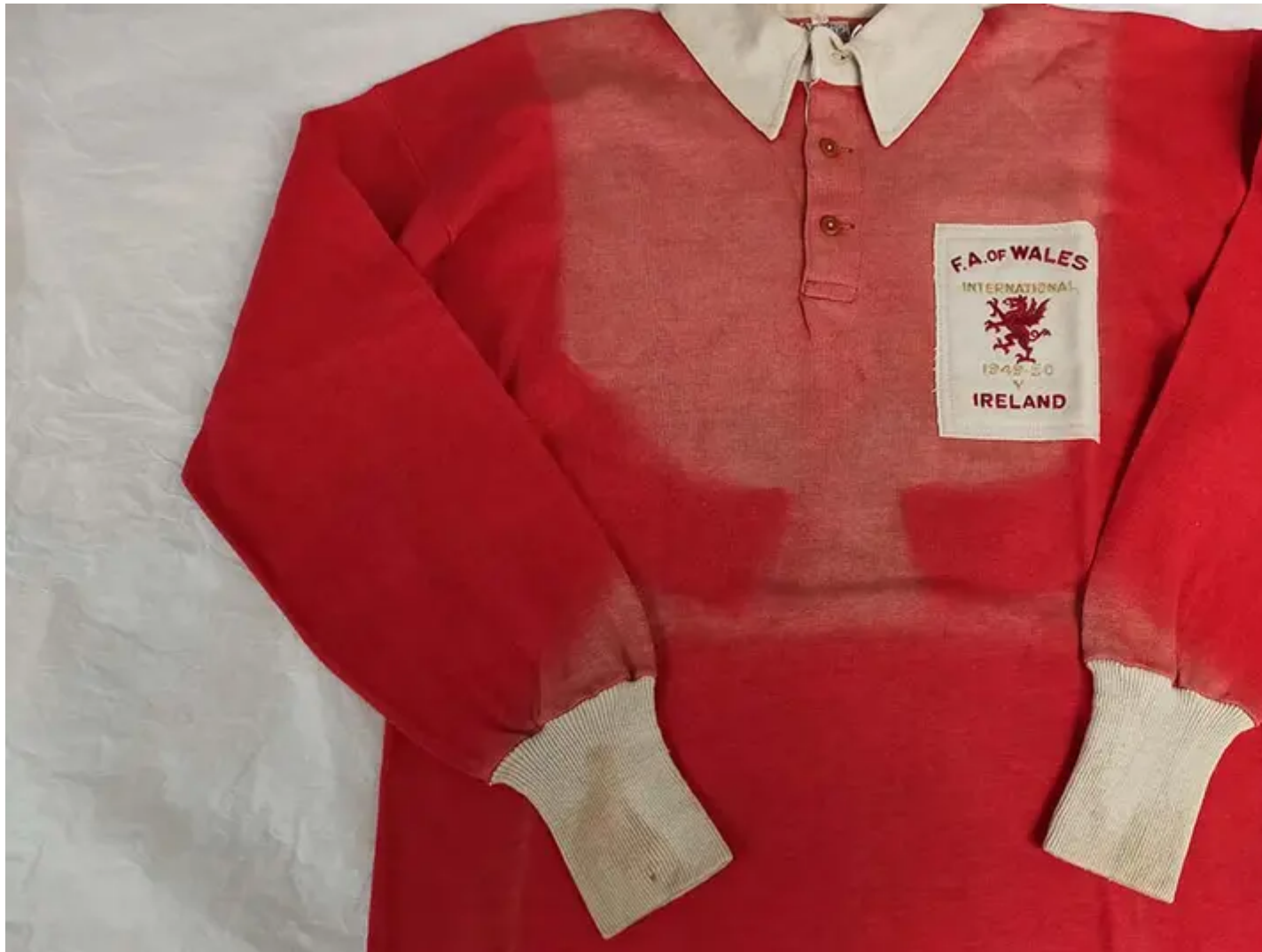
John Charles' debut shirt for Wales v Ireland 1950.

The Lancashire Cricket Heritage Experience (awarded £176,650) will develop plans to bring an interactive heritage hub to the Emirates Old Trafford cricket ground. The museum will feature immersive technology, interactive displays and hands on exhibits.