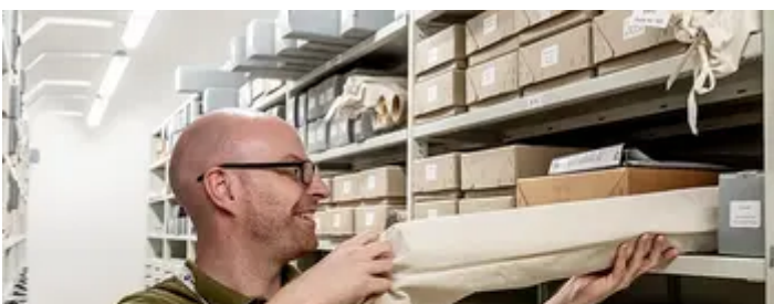
ates football and community heritage