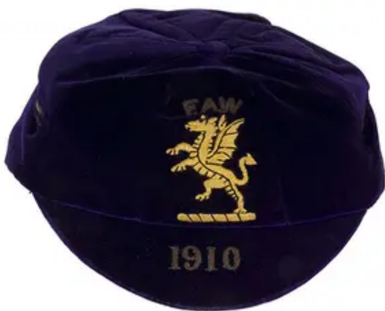
Billy Meredith's cap from the Scotland vs Wales match in 1910.