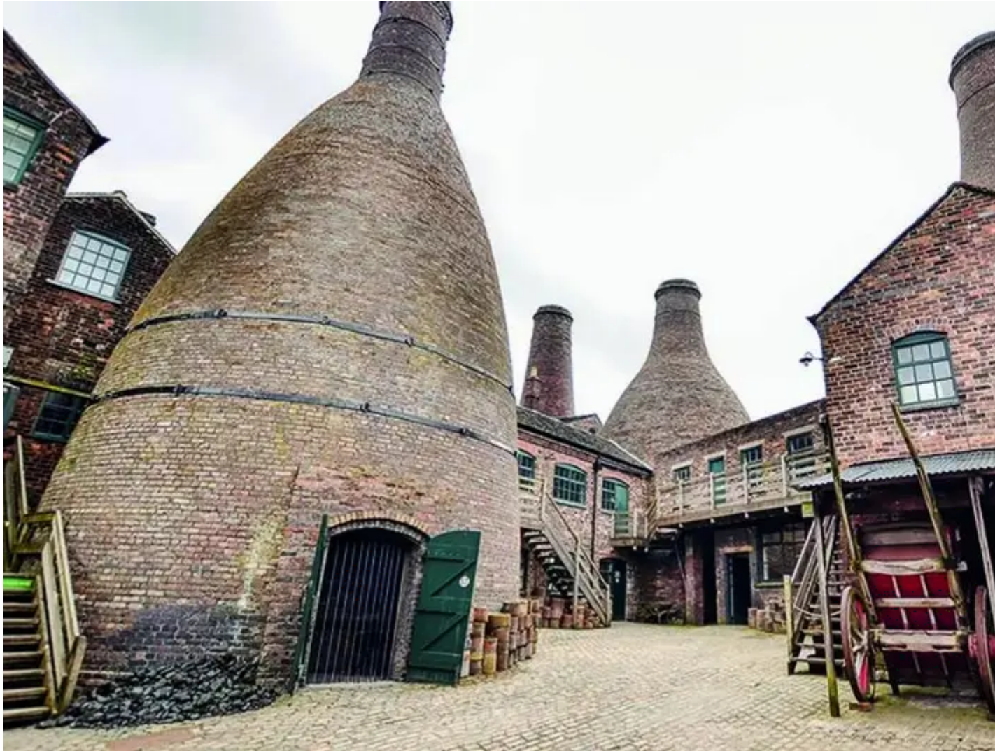
Stoke-on-Trent is famous for its pottery and ceramics heritage, showcased at places such as Gladstone Pottery Museum.

Medway Council (awarded £250,000) are offering community grants to celebrate local stories and help heritage and community organisations form partnerships. Meanwhile Electric Medway (awarded £90,000) is working with young people to collect stories of life in Medway from the 1960s to the 1980s.