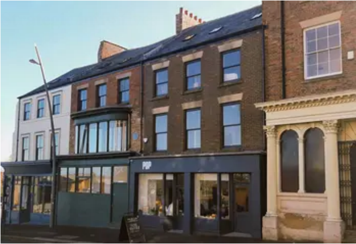
Georgian houses in Sunderland after restoration by the Tyne and Wear Preservation Trust.