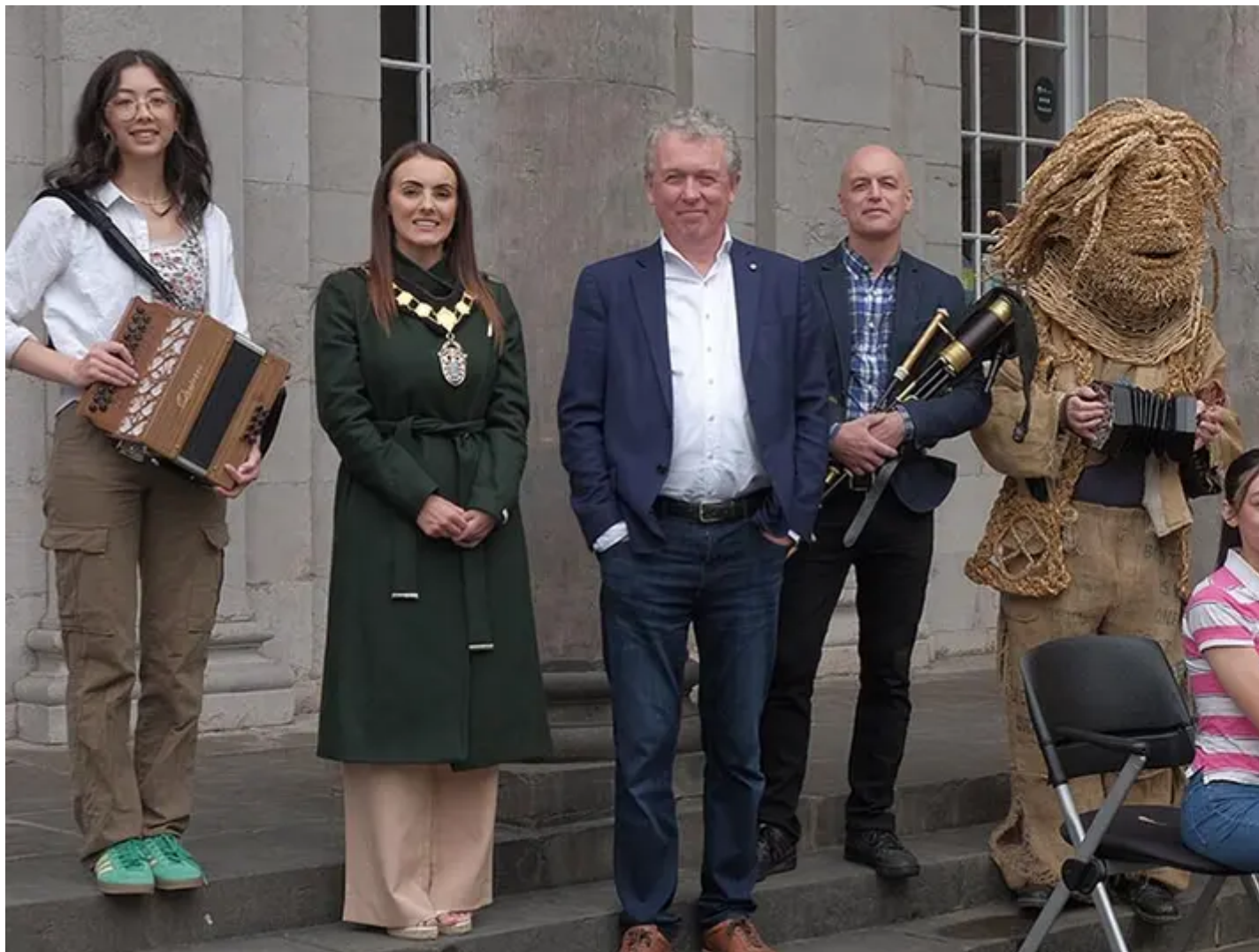
Armagh City, Banbridge and Craigavon have recently been awarded funding through Heritage Places.

Glasgow's Sauchiehall Street (awarded £350,000), famous for its architectural, performing arts and retail heritage, is the focus of a regeneration effort to preserve heritage at risk and drive economic revival. We're supporting planning and feasibility work, including engagement, to ensure local stakeholders and communities' perspectives shape Sauchiehall Street's future.