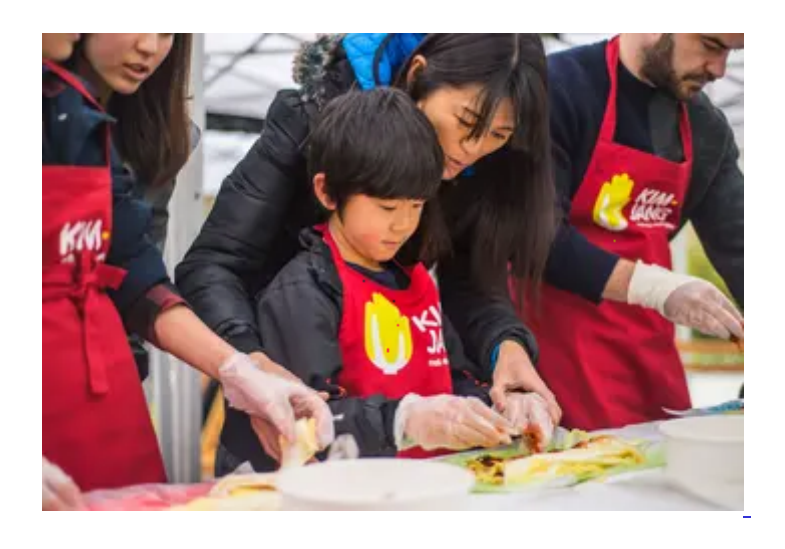
Understanding your heritage