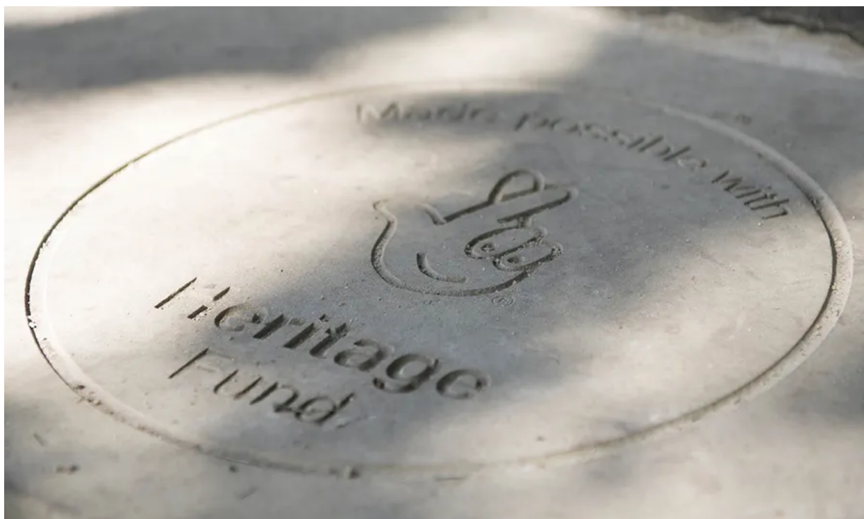
Acknowledgement at Bowring Park.